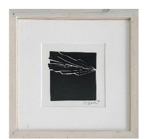
Youdhisthir Maharjan, Repeated Birth, 2011, autopoietic print on paper, 5.5 x 5.5 in. each

The other works in the exhibition focus on Maharjan's work as a conceptual printmaker. Repetition as process takes center-stage in works like Anantari Paryatna III: of Infinite Space (2011-2012), a visual illustration of the painstaking endless process, that the work's title describes. Consisting of six monumental scrolls each printed using the same 4 x 4-inch printing plate, the work transcends its careful premeditation to yield a seemingly spontaneous Pollockesque abstraction. What remains is a composition of textures and patterns that turn the surface into a dynamic entity. These scrolls, with their unique visual codex, are intuitively decipherable and bafflingly elusive in equal parts.