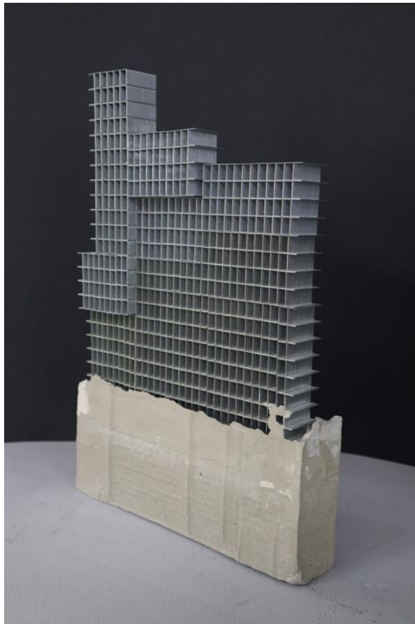
Pooja Iranna, Pervasive Mushrooming 6 , 2019 Cement, color, staple pins, 15 x 10.5 x 2 in.

Centre for Contemporary Art, Bikaner House, India Gate, New Delhi