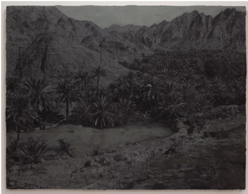
Saad Qureshi, Sacred Garden I , 2017

Wood ash, black sand, charcoal and ink on Gaboon plywood, 63 x 83 in.