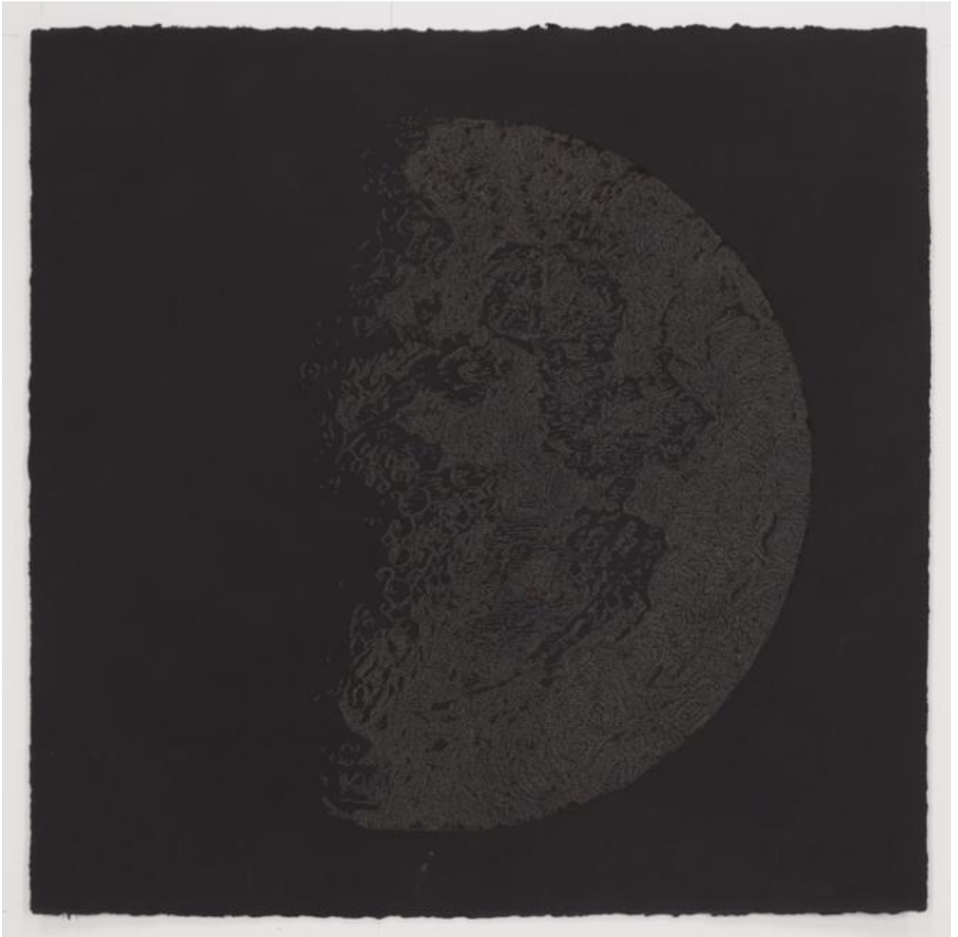
Saad Qureshi, Absence of Light II, 2017, Paint, burnt paper, 22 x 22.5 in.