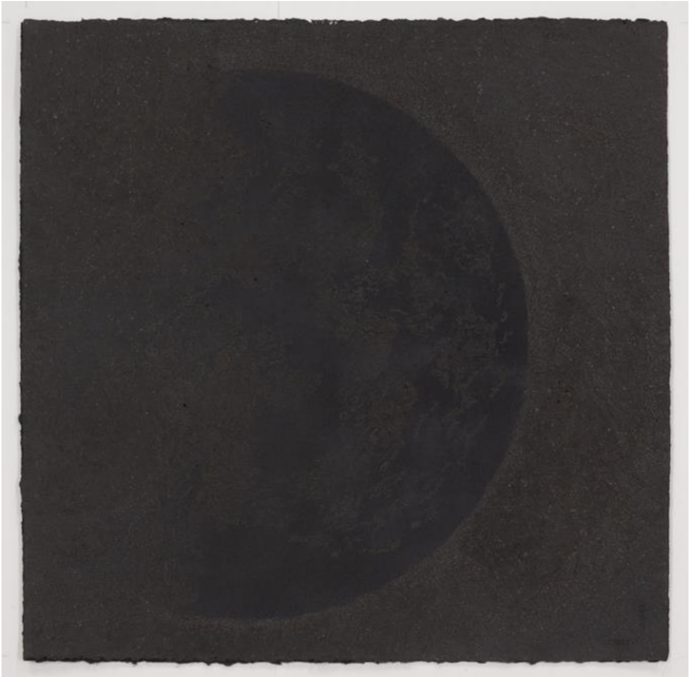
Saad Qureshi, Absence of Light I, 2017, Paint, burnt paper, 22 x 22.5 in.