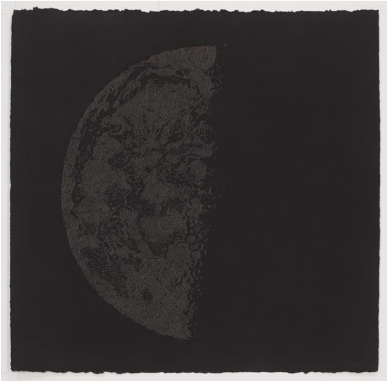
Saad Qureshi, Absence of Light III, 2017, Paint, burnt paper, 22 x 22.5 in.