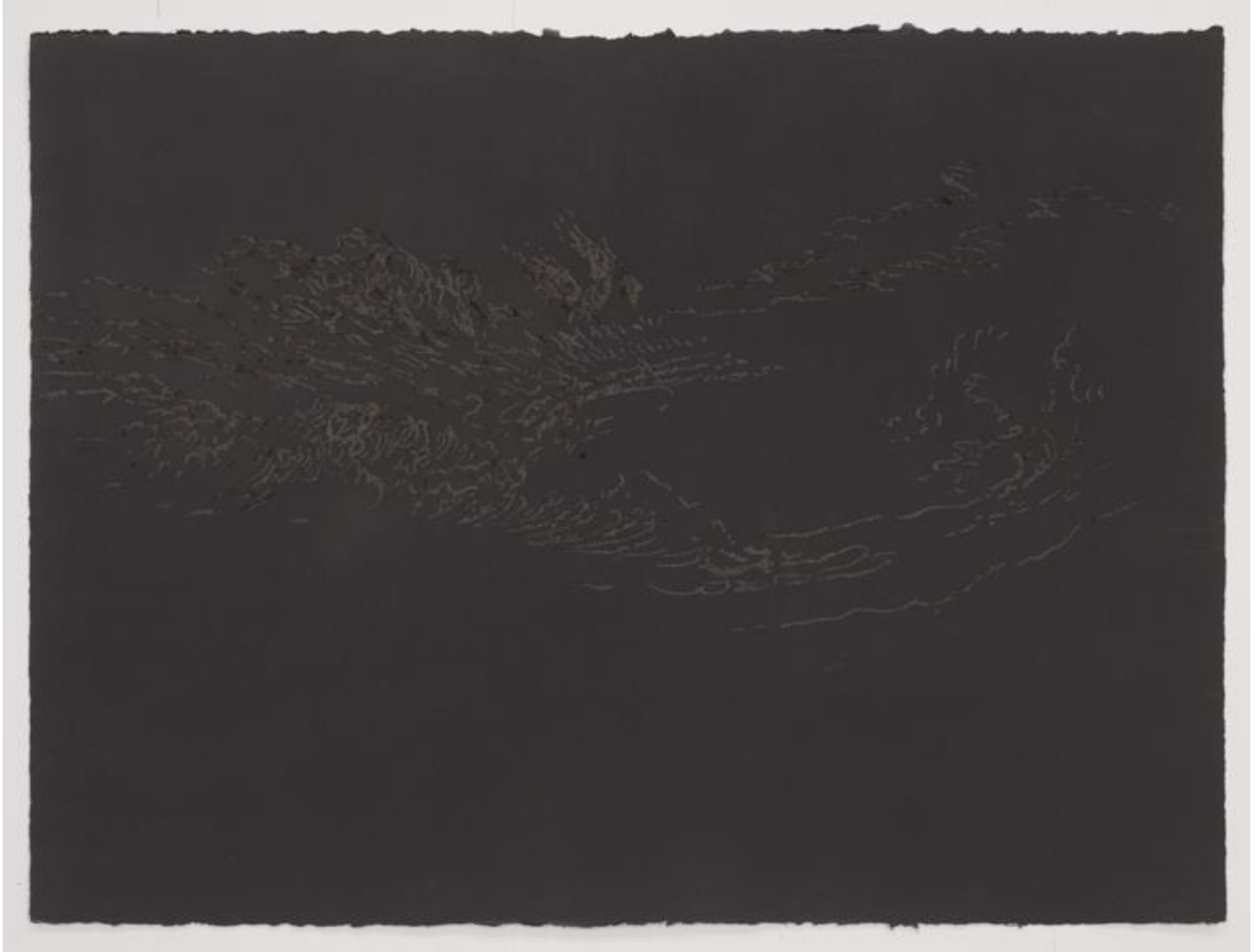
Saad Qureshi, Absence of Light VII, 2017, Paint, burnt paper, 22 x 30 in.