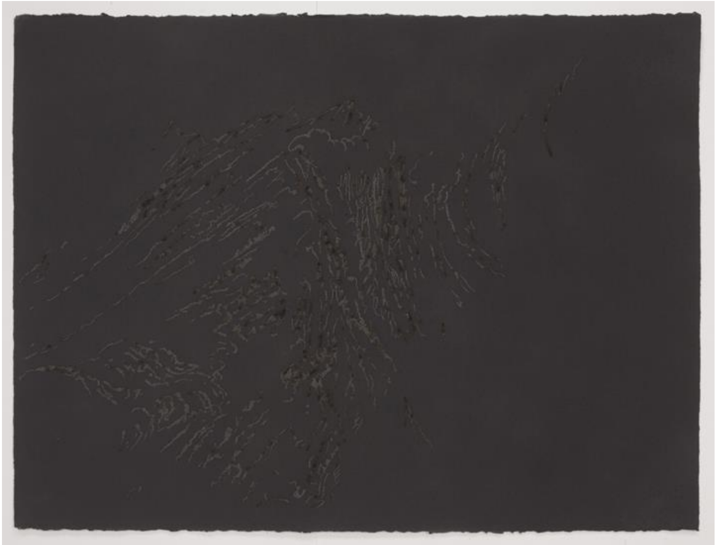
Saad Qureshi, Absence of Light VIII, 2017, Paint, burnt paper, 22 x 30 in.