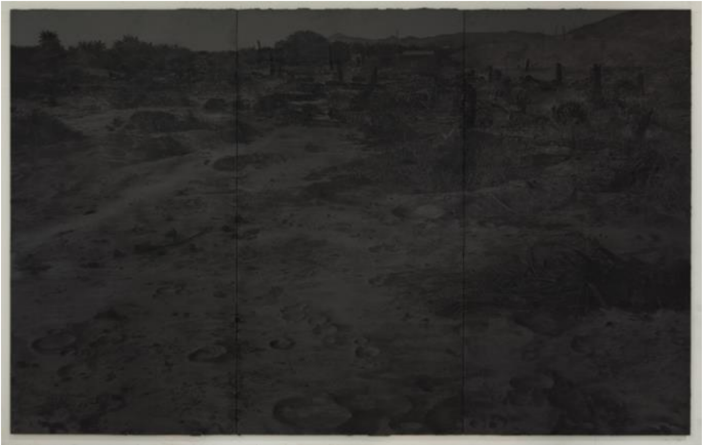
Saad Qureshi , Night That Witnessed , 2017, Wood ash, black sand, charcoal, and ink on Gaboon plywood, 90 x 144 in.