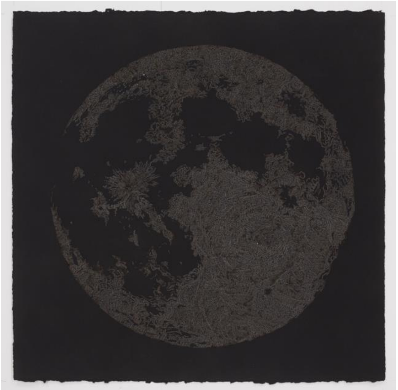
Saad Qureshi, Absence of Light IV, 2017, Paint, burnt paper, 22 x 22.5 in.