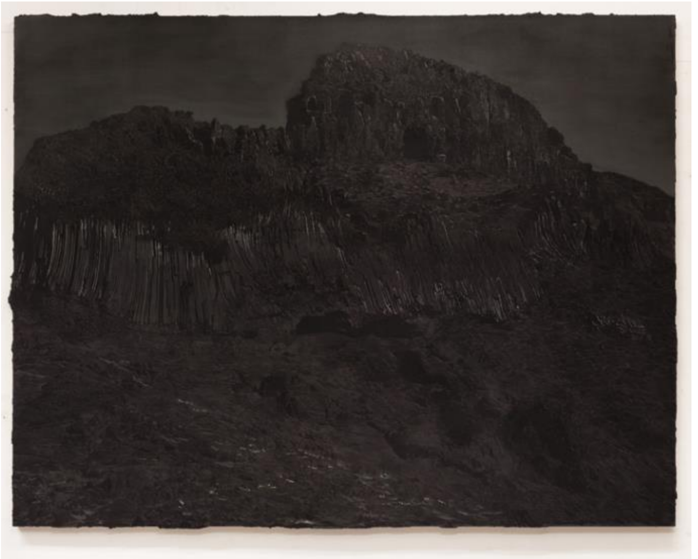
Saad Qureshi , Shadow of the Night , 2017, Wood ash, black sand, charcoal, and ink on Gaboon plywood, 73 x 95.5 in.