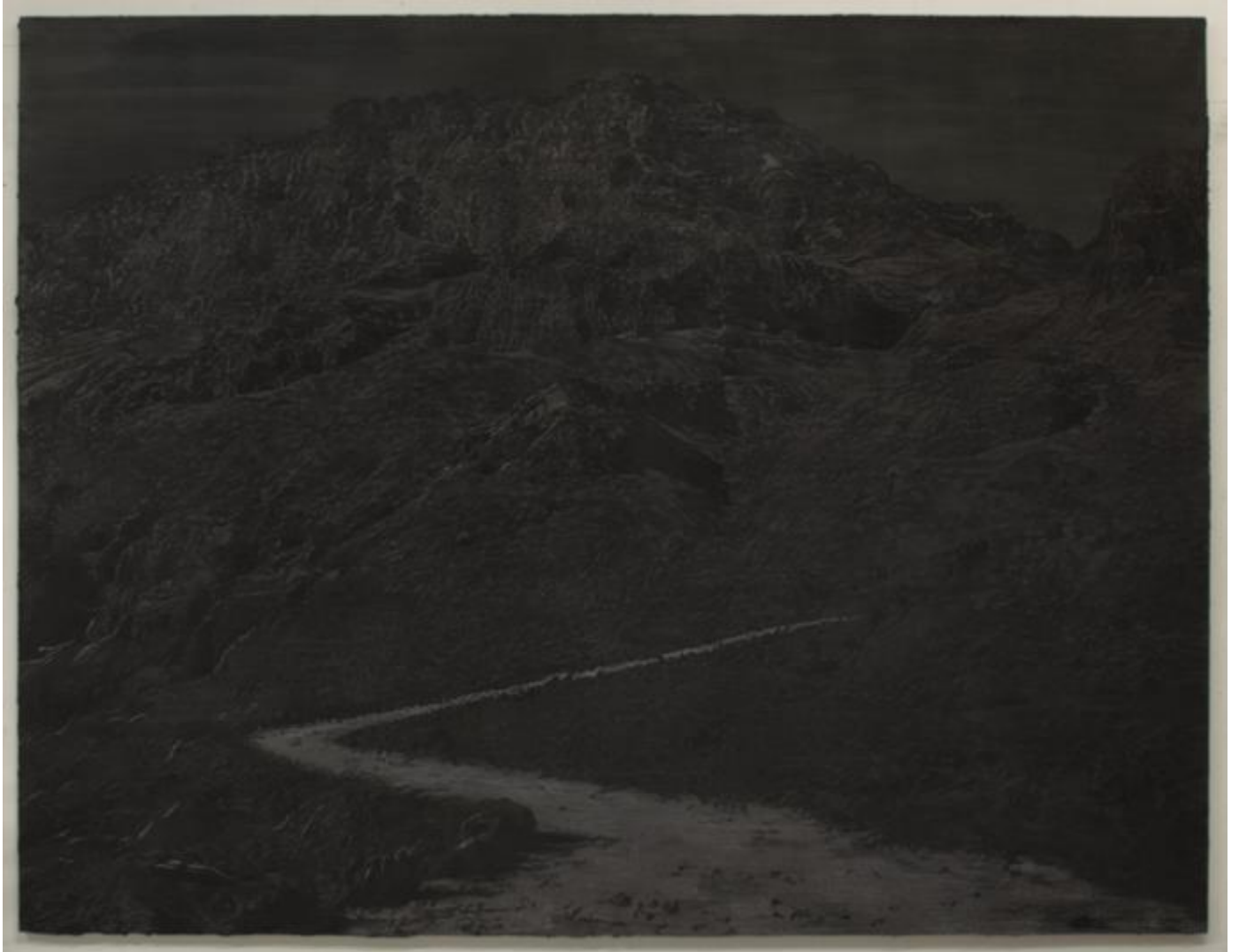
Saad Qureshi , Path to Light , 2017, Wood ash, black sand, charcoal, and ink on Gaboon plywood, 73 x 95.5 in.