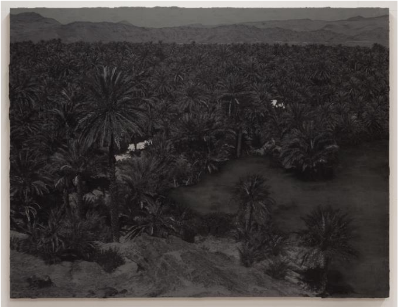
Saad Qureshi , Sacred Garden III , 2017, Wood ash, black sand, charcoal, and ink on Gaboon plywood, 63 x 83in.