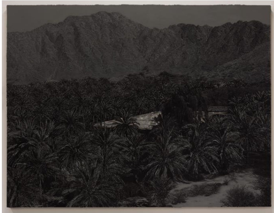
Saad Qureshi, Sacred Garden II , 2017

Wood ash, black sand, imitation silver leaf, charcoal and ink on Gaboon plywood, 63 x 83 in.