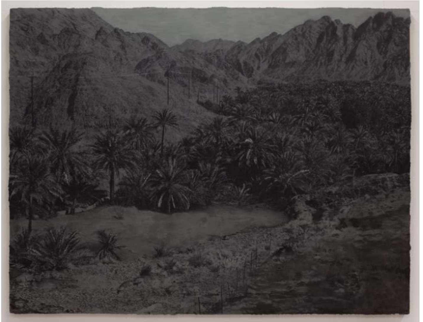
Saad Qureshi, Sacred Garden I , 2017, Wood ash, black sand, charcoal, and ink on Gaboon plywood, 63 x 83 in.