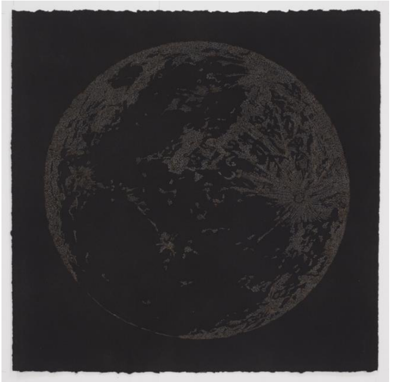
Saad Qureshi, Absence of Light V, 2017, Paint, burnt paper, 22 x 22.5 in.