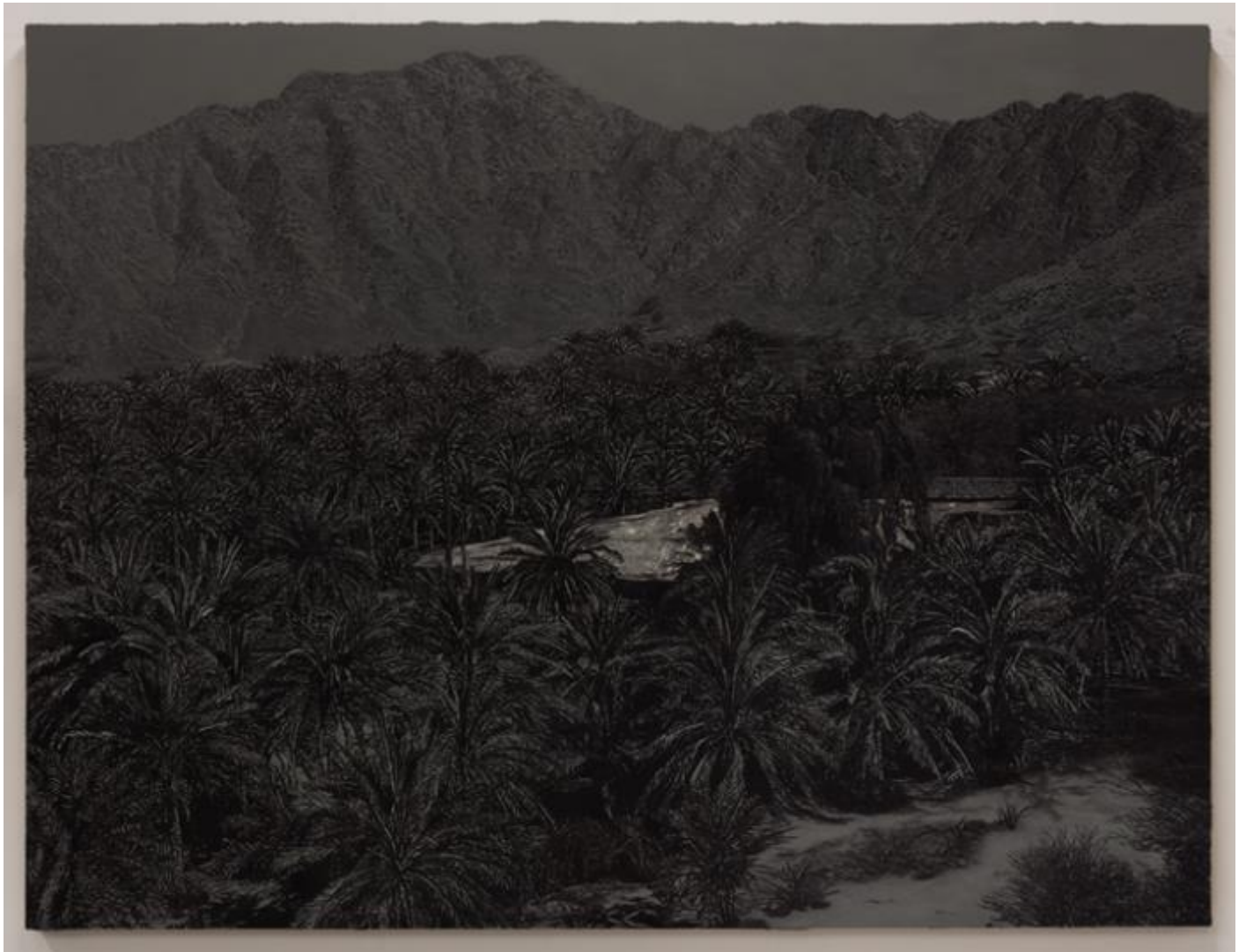
Saad Qureshi, Sacred Garden II , 2017, Wood ash, black sand, charcoal, and ink on Gaboon plywood, 63 x 83 in.