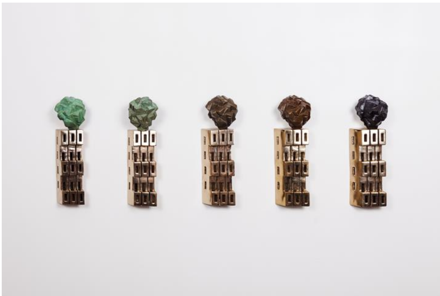
Gigi Scaria , Philosopher's Stone , 2017, Bronze, 13 x 4.5 x 3.5 in. (x5)