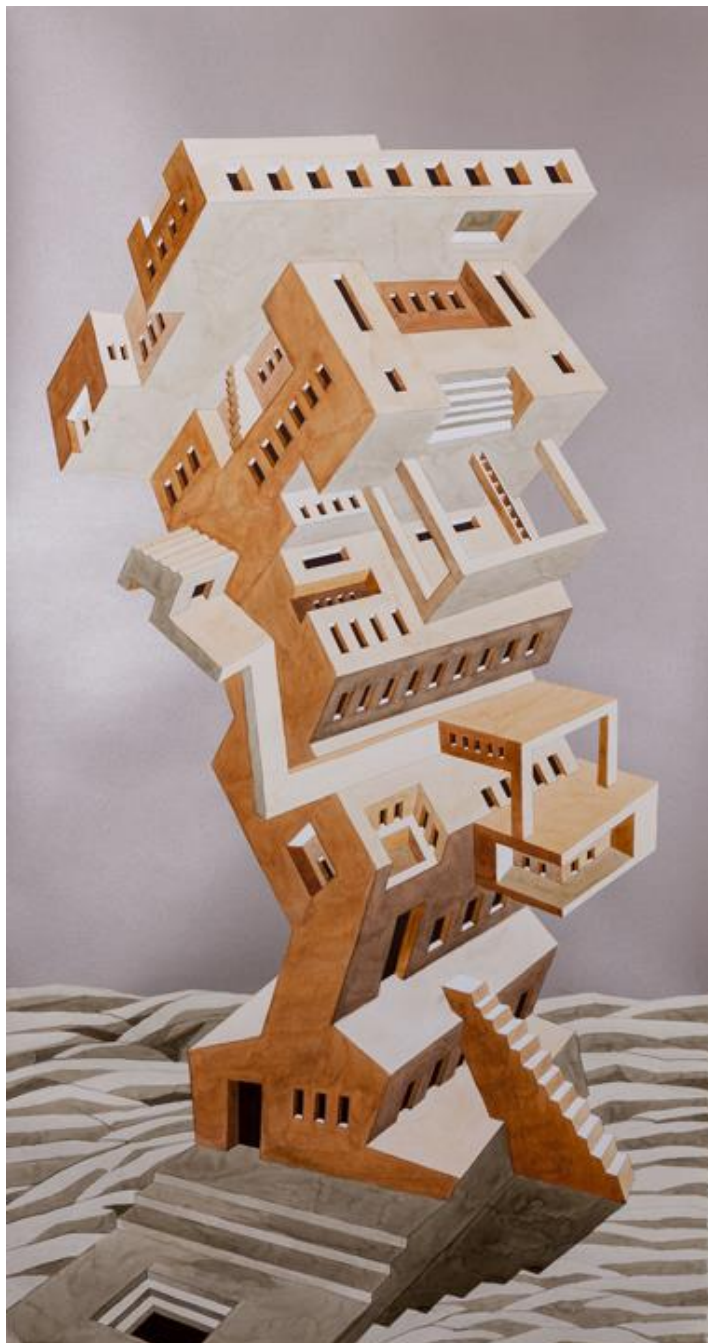
Gigi Scaria , Uncertain Terrains , 2017, Watercolor and automotive paint on paper, 58 x 30.5 in.