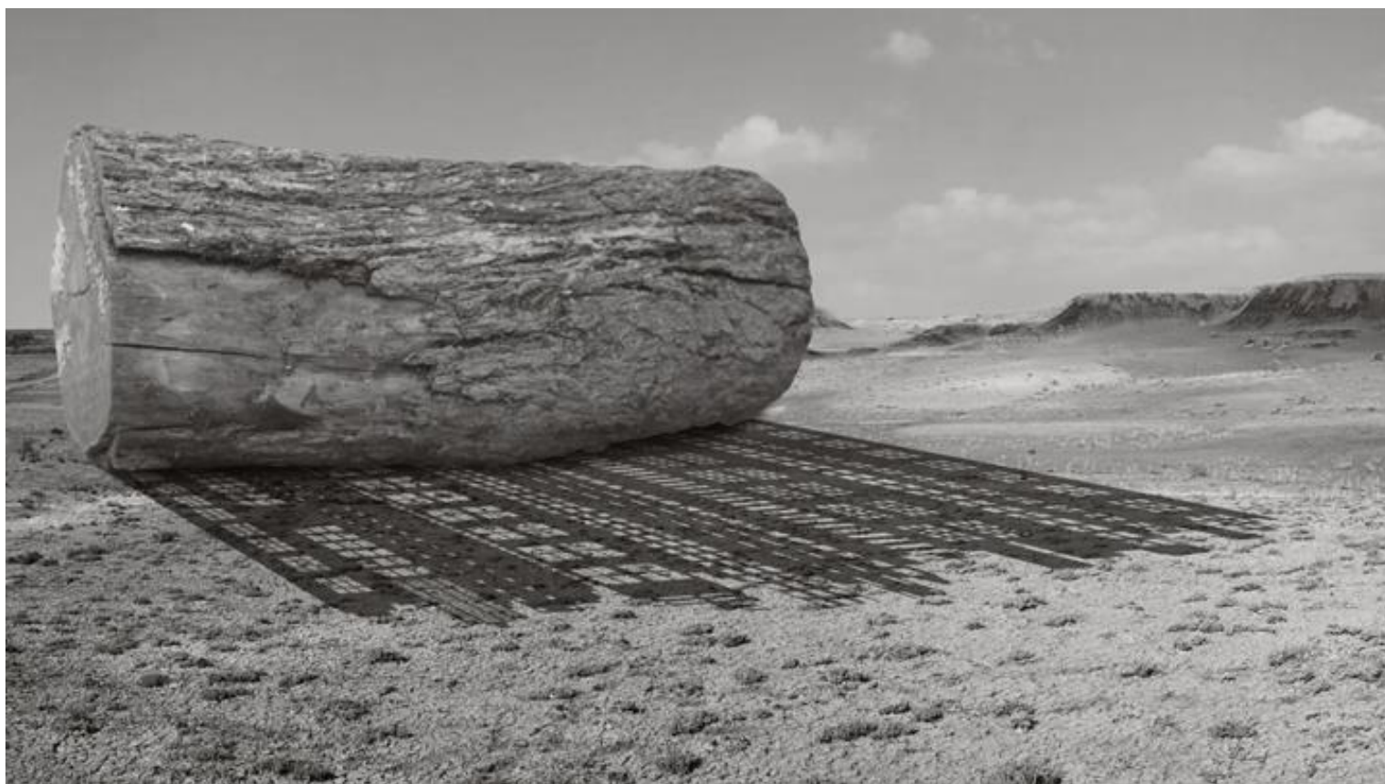
Gigi Scaria , Shadow of the Ancestors , 2015, Single-channel projection with sound, 4:00 min.