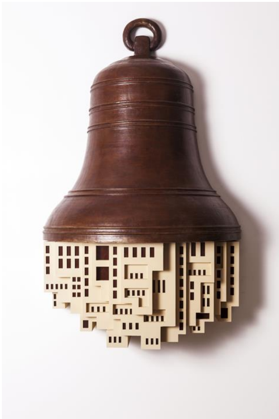
Gigi Scaria , Scream , 2017, Bronze and plastic, 37 x22.5 x 12 in.