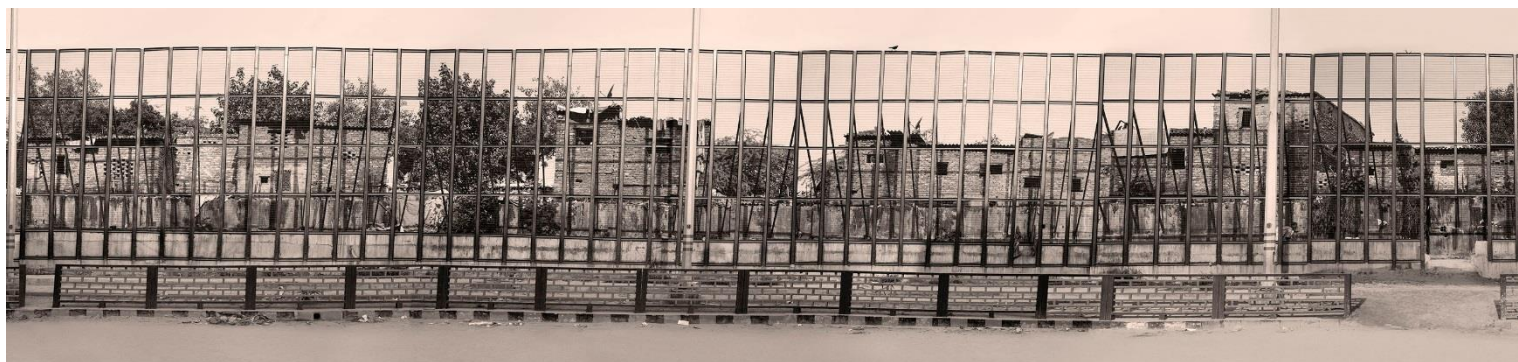
Gigi Scaria , All About This Side , 2017, Inkjet print on archival paper, 11.5 x 180 in.