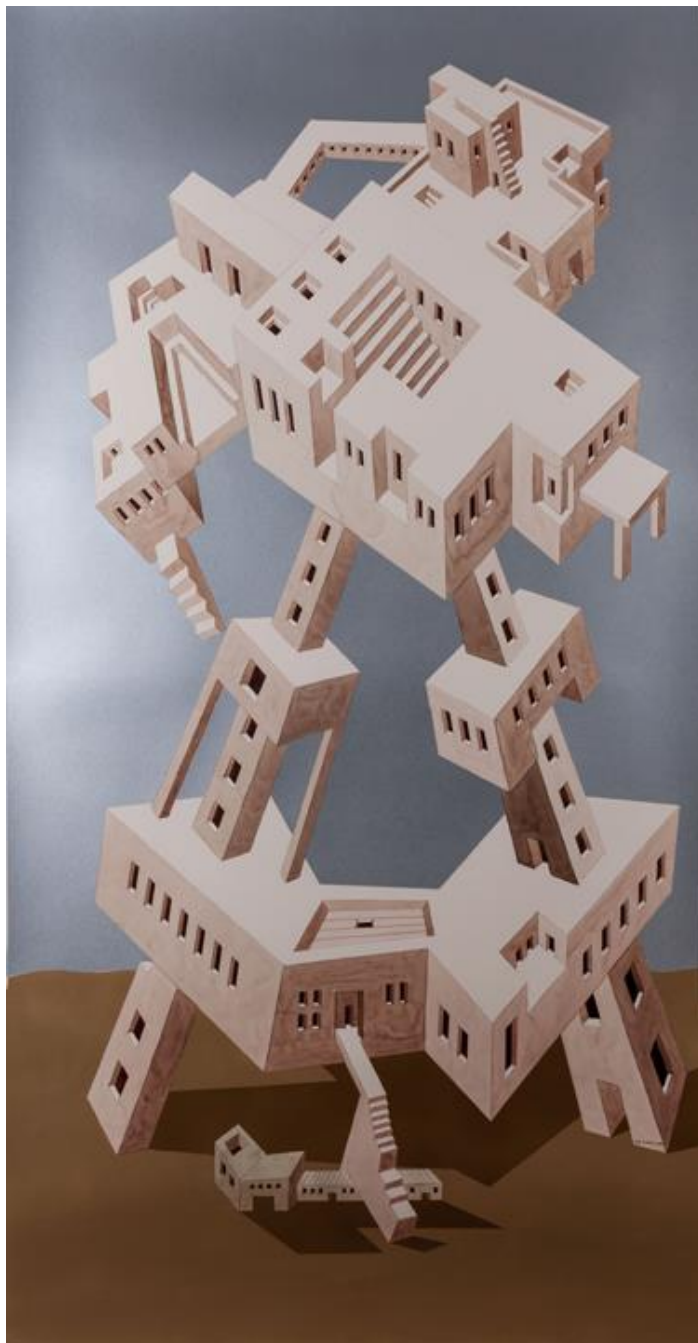
Gigi Scaria , Ladders of Gravity , 2017, Watercolor and automotive paint on paper, 58 x 30.5 in.