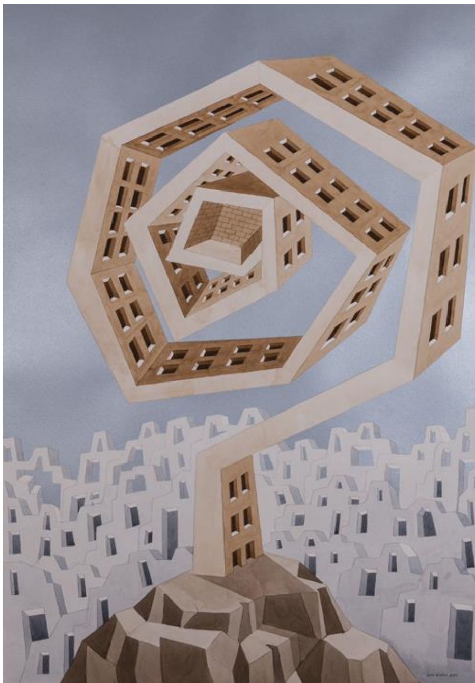
Gigi Scaria , Center of Gravity , 2017, Watercolor and automotive paint on paper, 40.5 x 28.5 in.