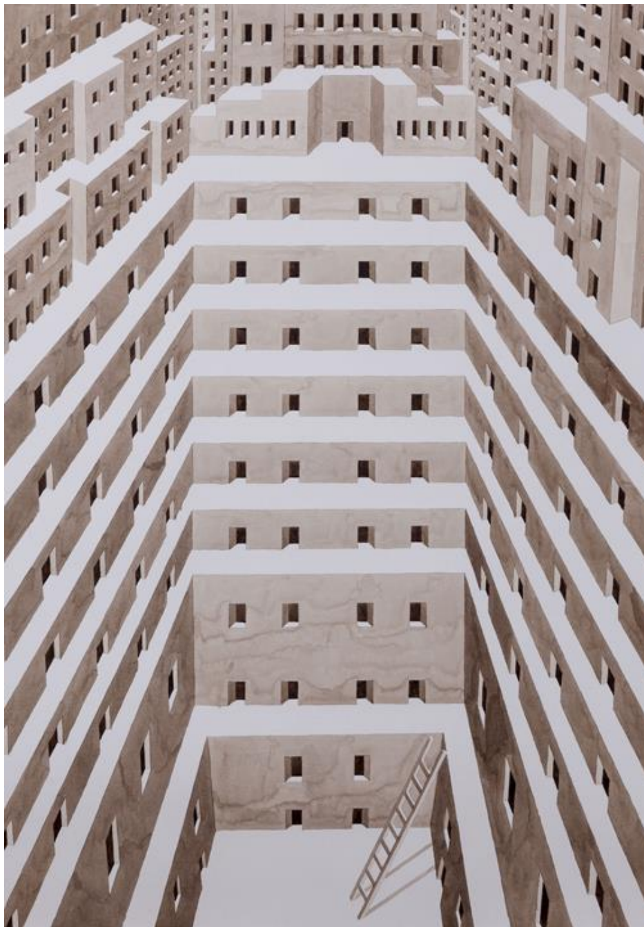
Gigi Scaria , Core , 2017, Watercolor on paper, 40.5 x 28.5 in.