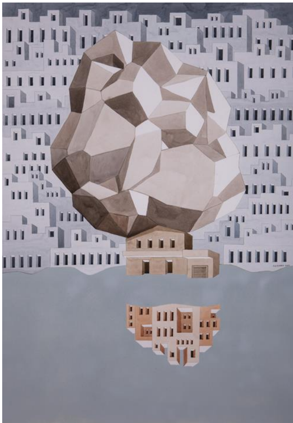
Gigi Scaria , Meteor , 2017, Watercolor on paper, 40.5 x 28.5 in.