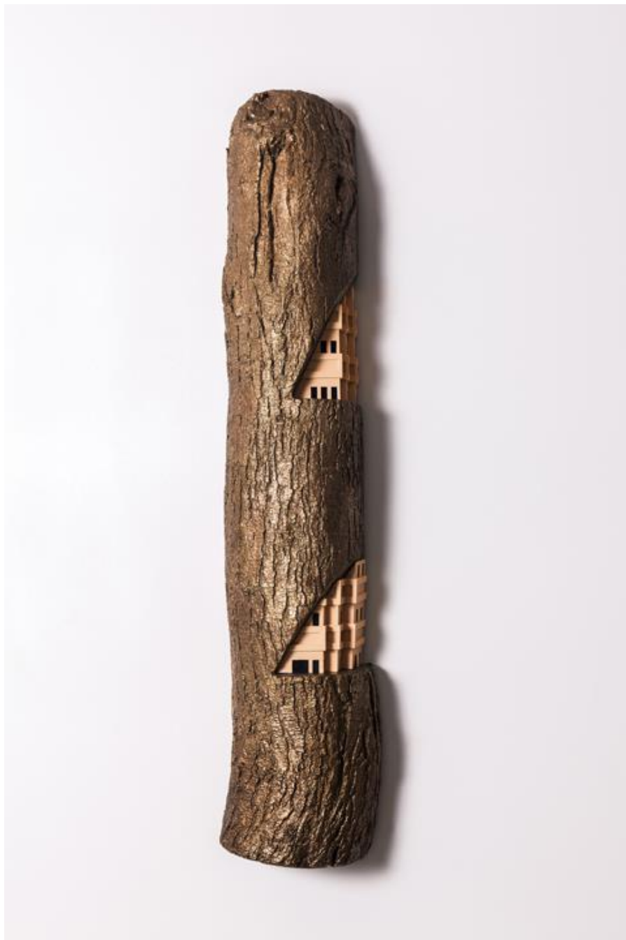
Gigi Scaria , Skin Deep , 2017, Bronze and plastic, 30.5 x 6.5 x 3.5 in.