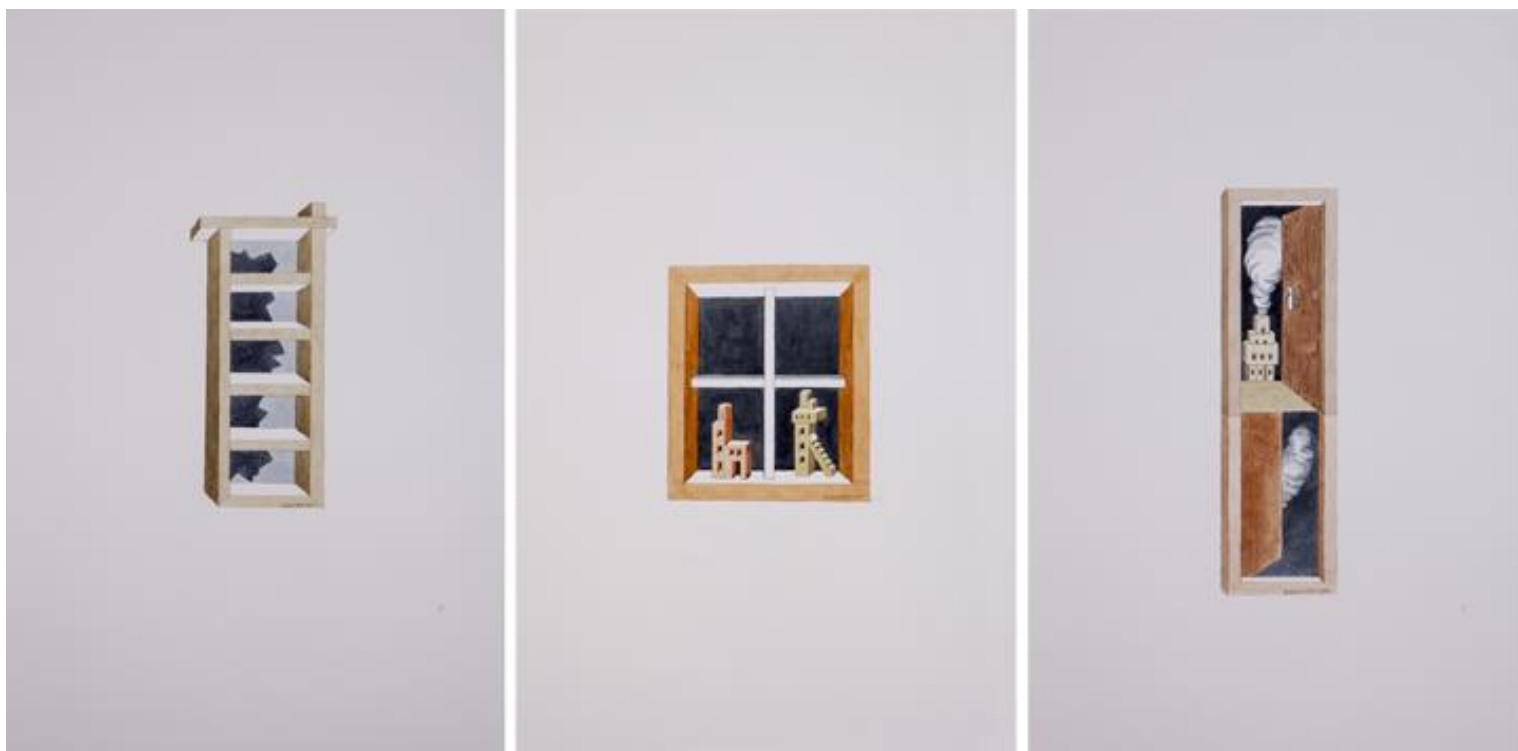
Gigi Scaria , Slashes on the Wall (Triptych), 2017, Watercolor on paper, 30.5 x 67.5 in.