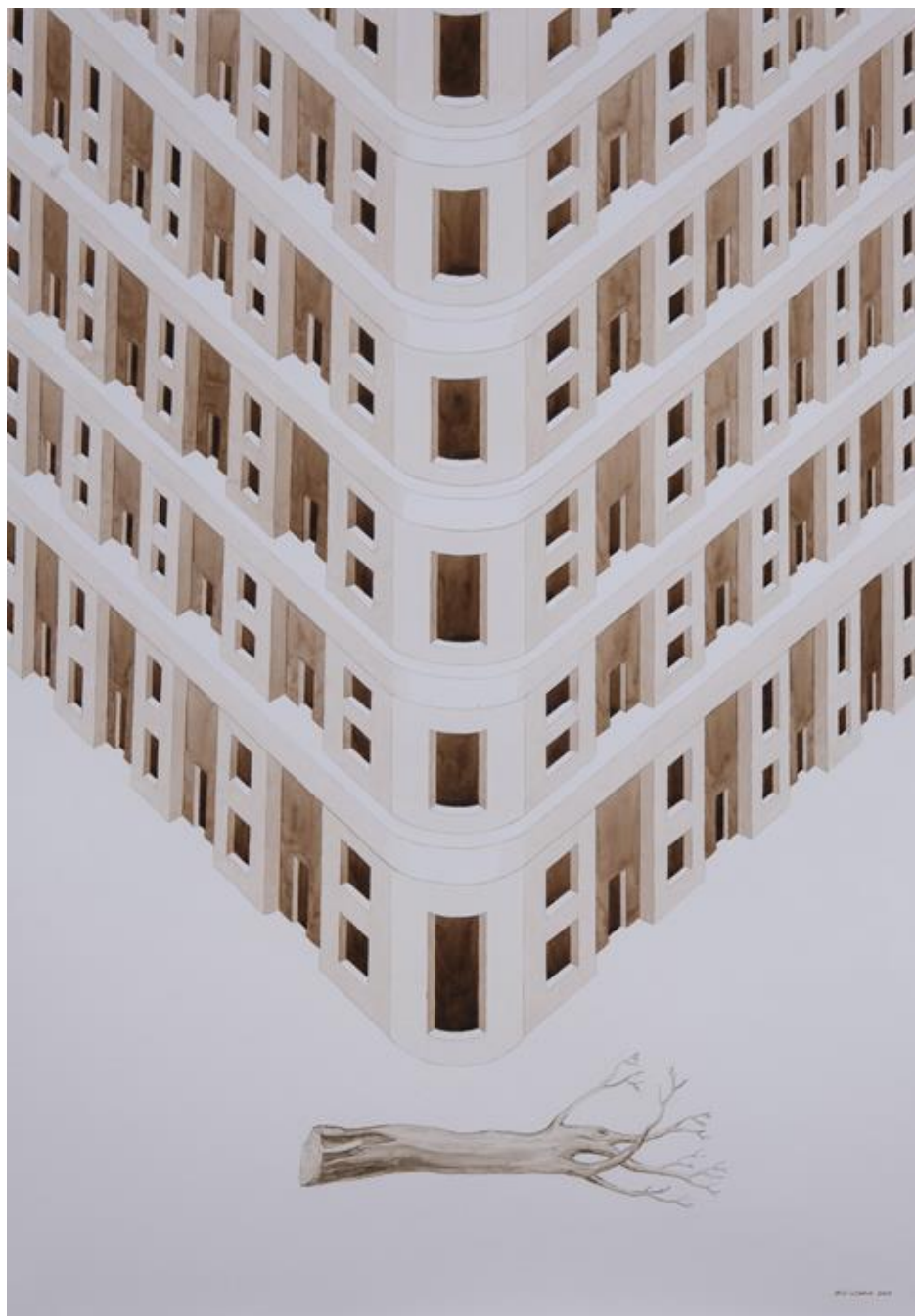
Gigi Scaria , Detached , 2017, Watercolor on paper, 40.5 x 28.5 in.