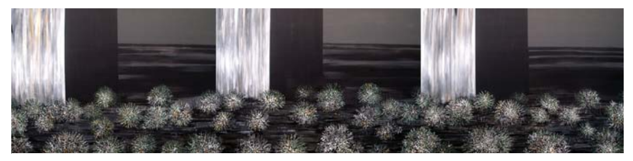
Rajan Krishnan There Was a River There; Its Banks Filled with Golden Sand! Acrylic on canvas, 2011 60 x 251.5 in.

generations, its waterways shaped the culture and lives of those in South Malabar, and more specifically the artist's birthplace of Kerala. The river itself served as a lifeline to a vast region, providing literal and cultural sustenance to the countless cities and villages spanning its length – from the Western Ghats, to the Arabian Sea. Yet, the bleak contemporary existence to which this once powerful icon of India's cultural and natural history has been diminished leaves Krishnan's images – like the river itself – stranded somewhere between between memory and actuality; between our shared perceptions of the past, and the tangible yet continually shifting realities of our present and future.