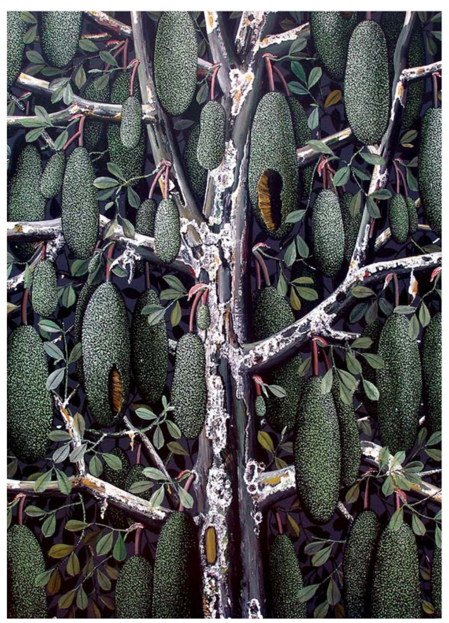
Rajan Krishnan, Plant from the Grove by the River 1, 2011, Acrylic on canvas, 84 \times 60 in.