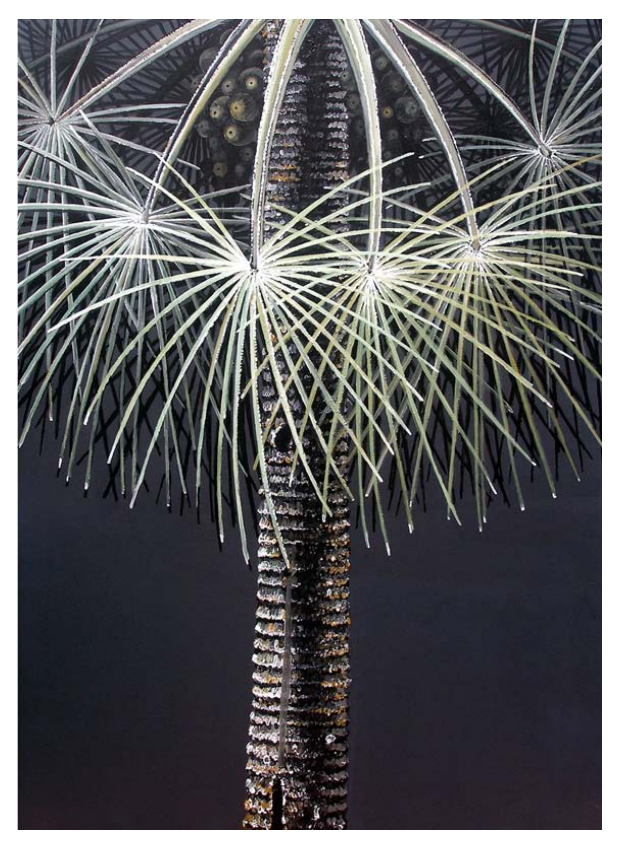
Rajan Krishnan Plant from the Grove by the River 1 Acrylic on canvas, 2011 84 x 60 in.

VIP Preview & Opening Reception: Thursday June 2, 6:00pm - 9:00pm