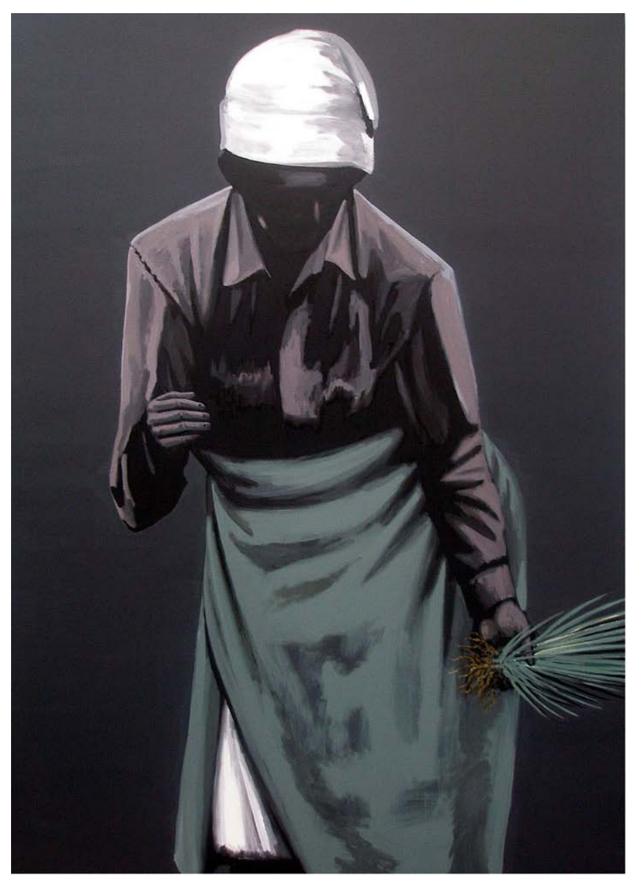
Rajan Krishnan, Peasant Woman , 2011, Acrylic on canvas, 84 x 60 in.