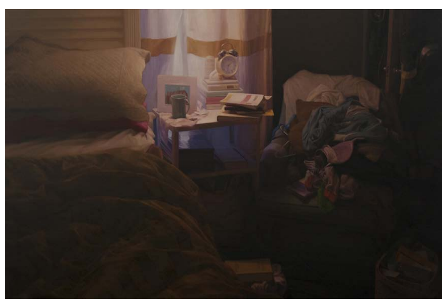
Abir Karmakar, Scent VII , 2011, Oil on canvas, 48 x 84 in.