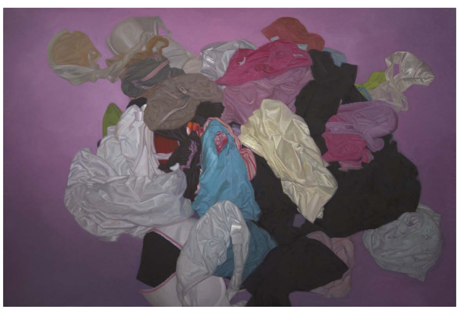
Abir Karmakar, Scent XI , 2011, Oil on canvas, 36 x 48 in.