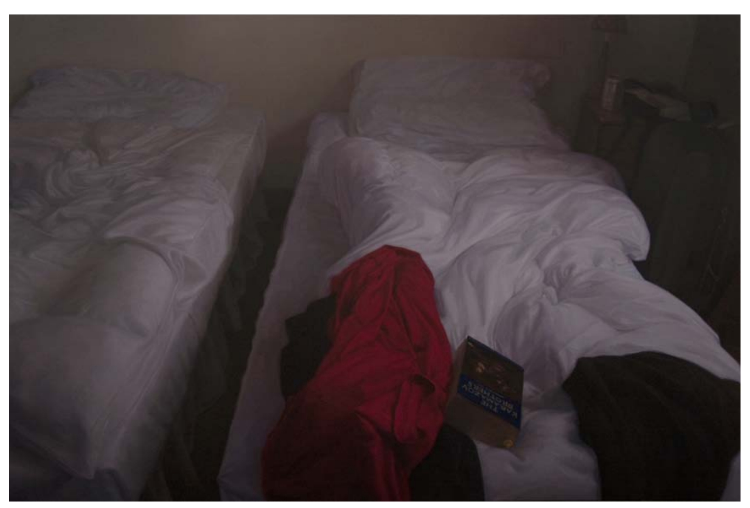
Abir Karmakar, Scent V, 2011, Oil on canvas, 48 \times 72 in.