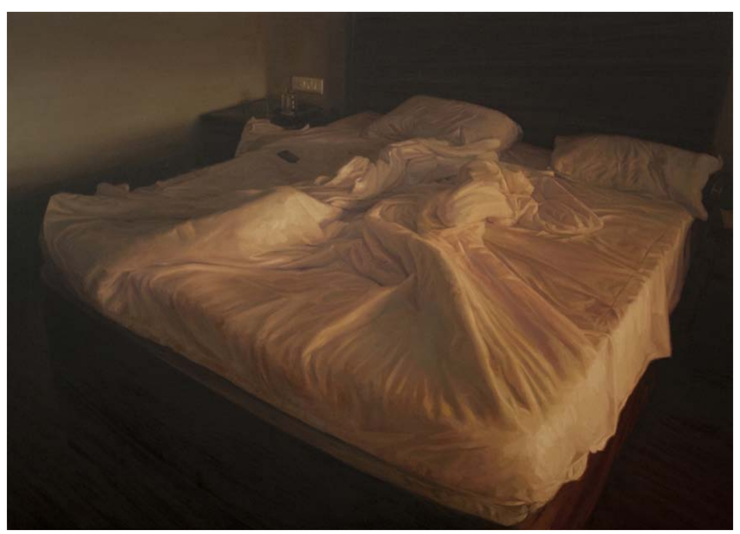
Abir Karmakar, Scent II, 2011, Oil on canvas, 48 \times 72 in.