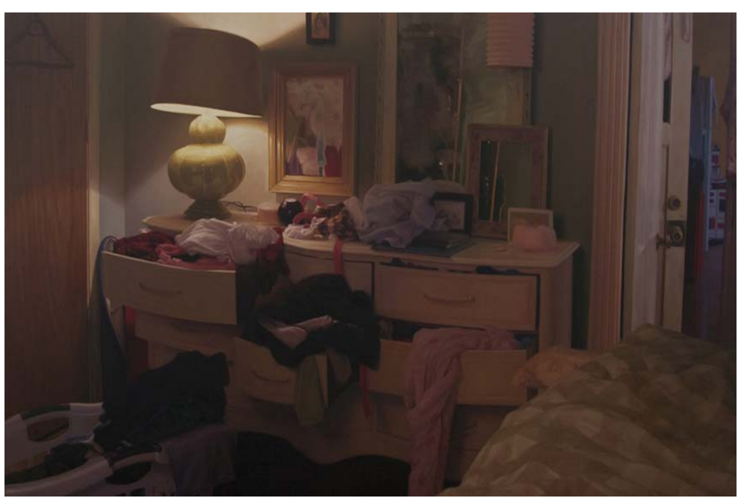
Abir Karmakar, Scent VIII, 2011, Oil on canvas, 48 \times 84 in.