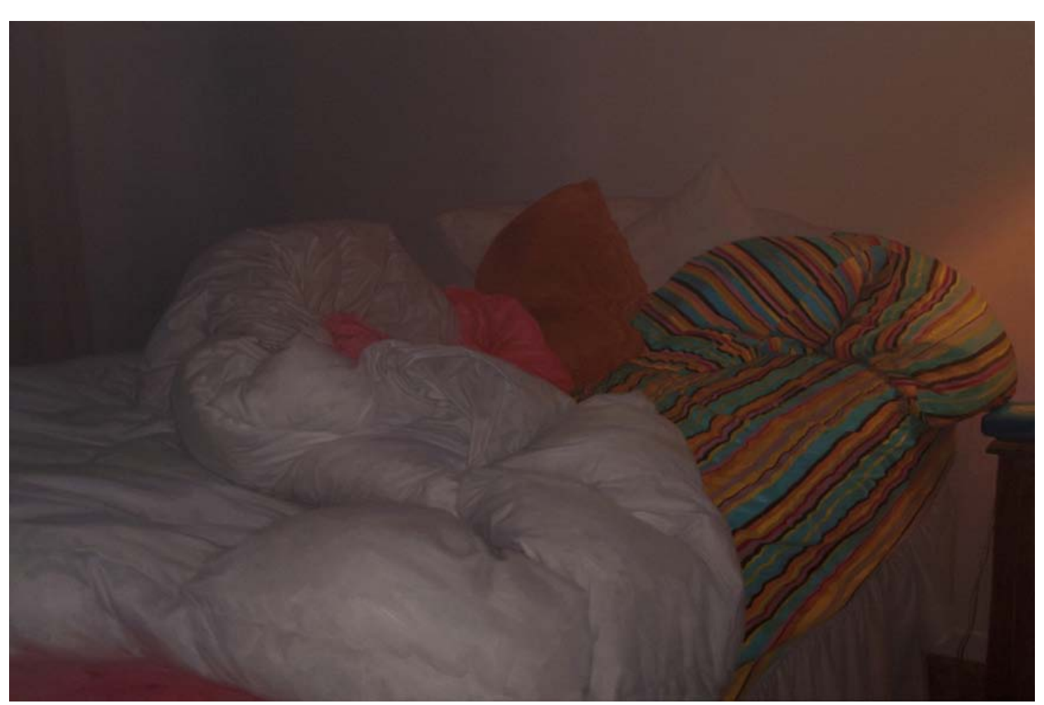
Abir Karmakar, Scent IV, 2011, Oil on canvas, 48 \times 72 in.