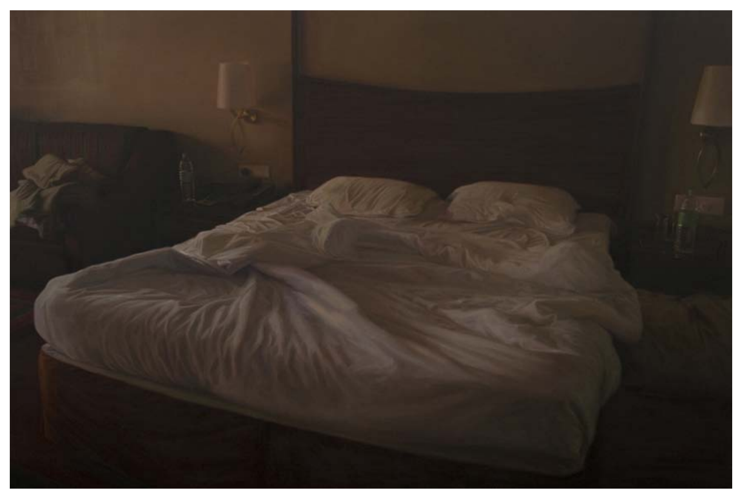
Abir Karmakar, Scent III, 2011, Oil on canvas, 48 \times 72 in.