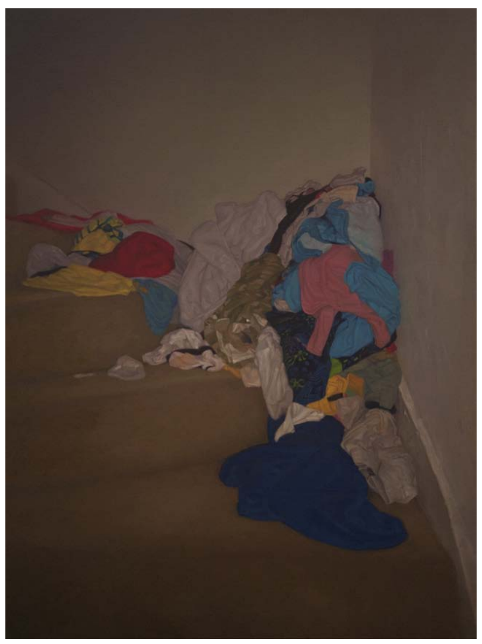
Abir Karmakar, Scent X , 2011, Oil on canvas, 48 \times 36 in.