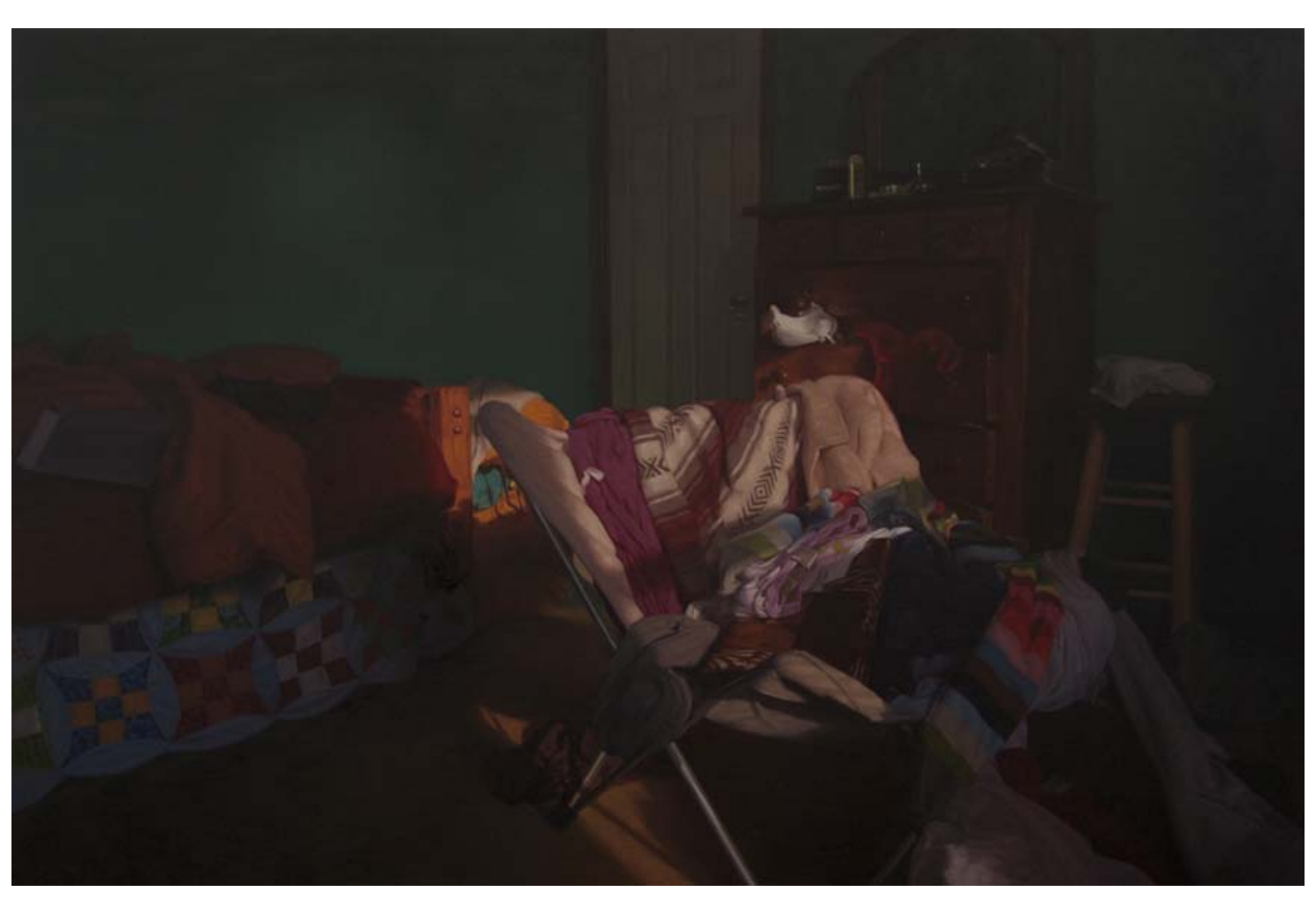
Abir Karmakar, Scent VI, 2011, Oil on canvas, 48 \times 72 in.