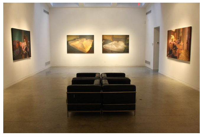
Abir Karmakar, The Morning After (Installation Shot)

Two ingeniously crafted single and multiple channel videos that accompany the exhibition set the tone for the viewer's complete engagement with the work. Karmakar's dexterous superimposition of images, gleaned from footage of three individual sleeping figures obtained over a period of three separate nights, suggests more than what meets the eye. Evocative of sexual play and titillation, these tableaus compel the observer to weave their own version of what might have transpired through the night. Despite the presence of human bodies in the video images, these fleeting, transitory glimpses of intimacy anticipate their absence and the viewer's need to provide signs of human presence and interaction in the accompanying oil paintings.