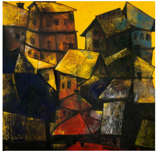
Paresh Maity, Sunlight , 2015, Oil on canvas, 66 x 60 in.

Earlier in his career, Maity briefly experimented with abstracts, which was more freeing of the limitations afforded by traditional landscape. One would still see an odd feature, like a building or a tree, though not in a purely representative rendering. Even when he returned to painting features and figures, the contextual setting was more generalized. The focus instead was placed on the idea of the figure, specifically faces and their myriad expressions, closely cropped and juxtaposed among vast surroundings. The stylized, simplified figures have a story of their own, transporting one into an exotic land. Early on, Maity painted many watercolors, done en plein air at different locations. There are recurrent motifs prevalent in Maity's images. Boats are often a recurring feature; to him, they are hypnotic in character, and not only symbols of movement and journey but also evocative of his boyhood memories. Then, there are old buildings with weathered facades, reflected in bodies of water or lining distant horizons. The other prominent character observed in Maity's visual language is his fascination for exploring textures, further enhanced by his experimentations across all painted mediums.