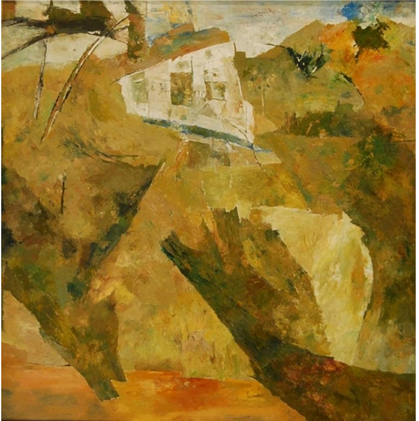
Ram Kumar , Untitled Landscape (House) , 2003, Oil on canvas, 36 x 36 in.