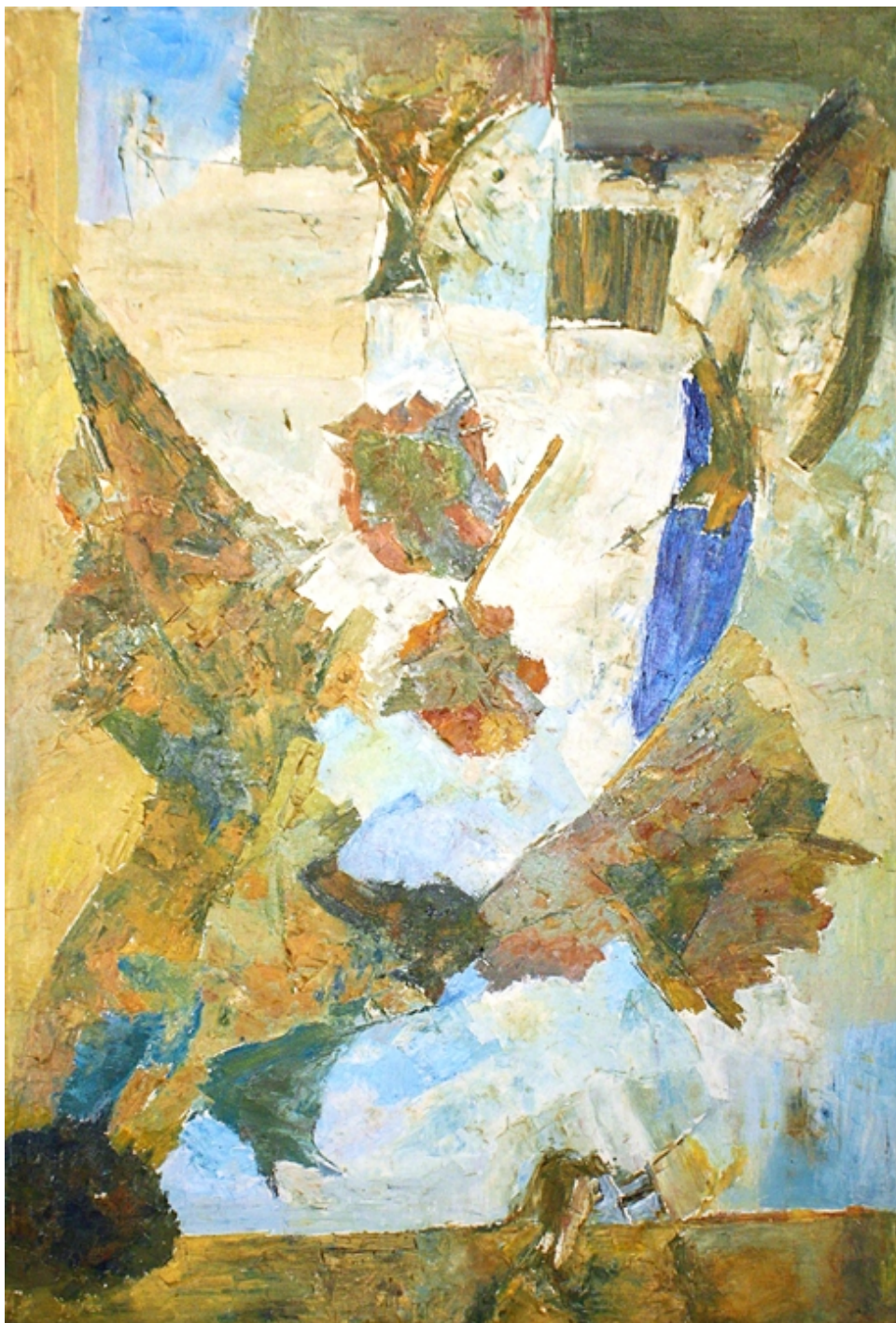
Ram Kumar , Untitled 2 , 2001, Oil on canvas, 36 x 24 in.