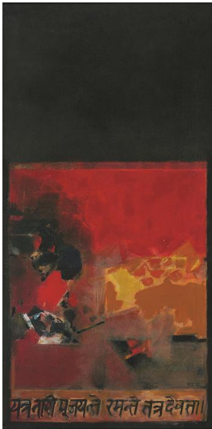
S. H. Raza , Gods Dwell Where the Woman is Adored, 1965, Oil on canvas, 39 x 20 in.