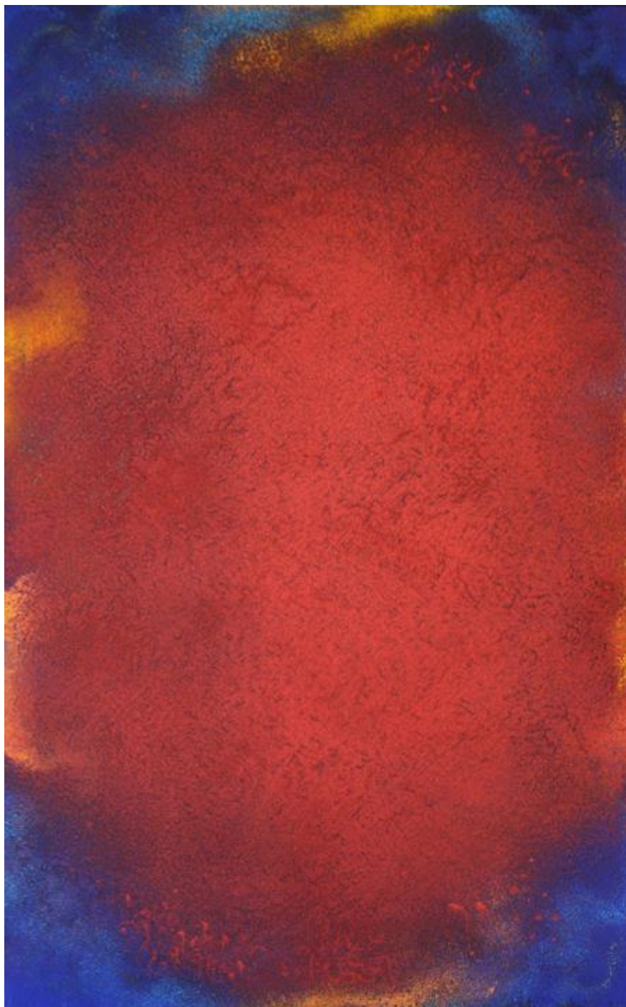
Natvar Bhavsar , Untitled , 2015, Oil on canvas, 48 x 30 in.