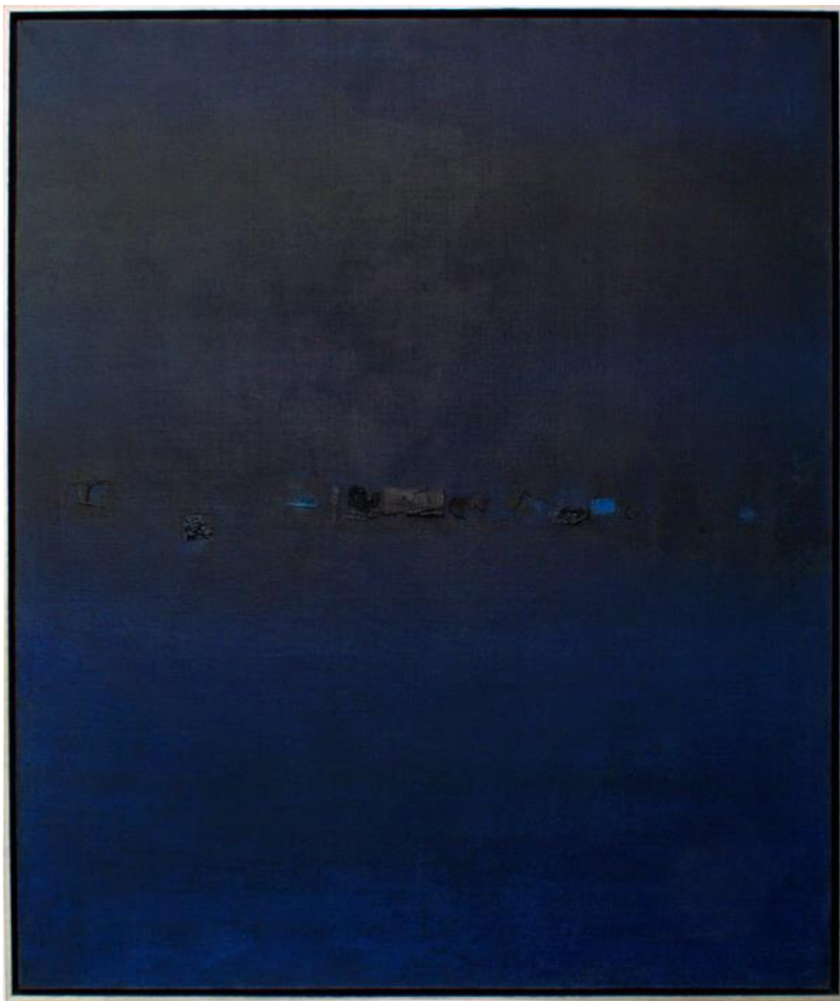
Vasudeo Gaitonde, Untitled (Blue) , 1963, Oil on canvas, 50 x 40 in.