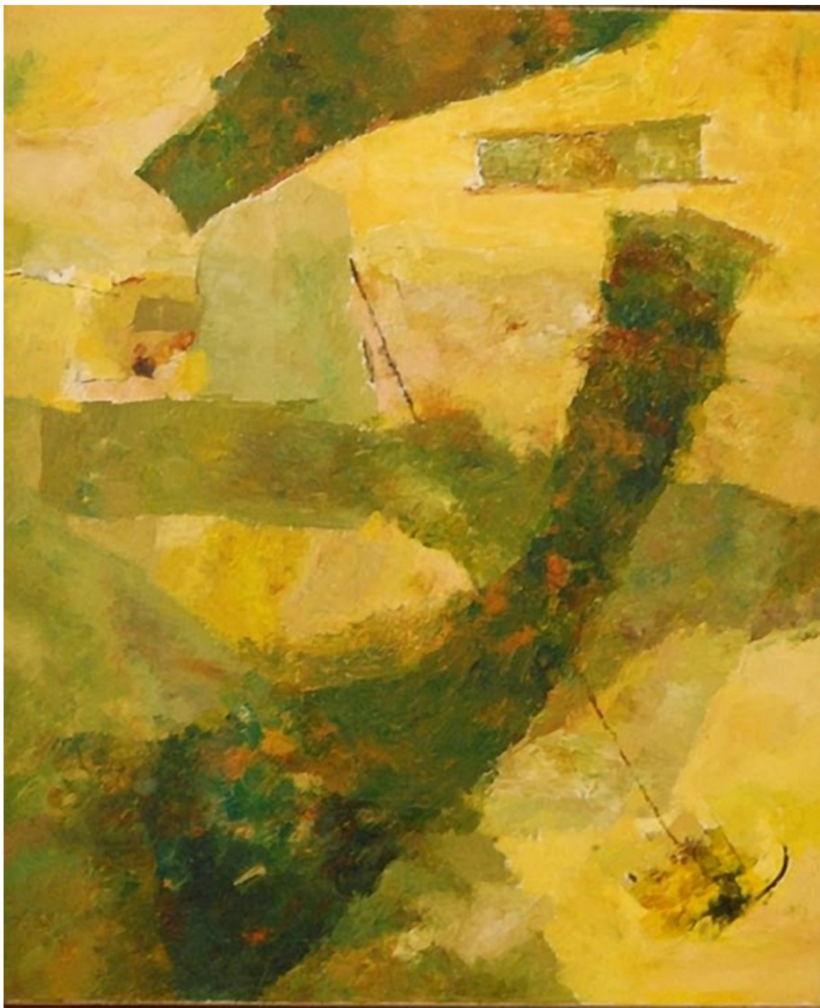
Ram Kumar , Untitled Abstract (Yellow/Green) , 2007, Oil on canvas, 36 x 30 in.