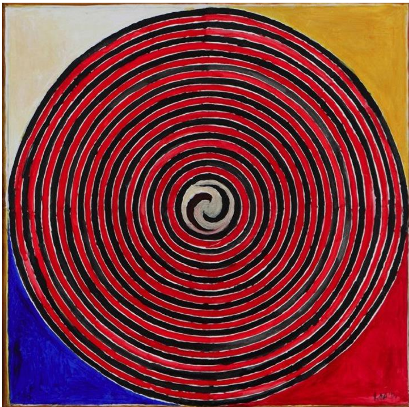
S. H. Raza, Kundalini , 2011, Acrylic on canvas 47 x 47 in.