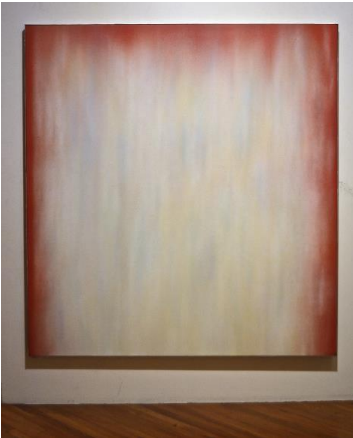
Natvar Bhavsar , Vasoo II , 1978, Oil on canvas, 73 x 69 in.