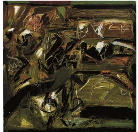
S. H. Raza, Untitled Abstract , 1970s, Acrylic on card, 31.5 x 31.5 in.

Vasudeo Gaitonde is often regarded as one of the finest and most evocative abstract painters of India; however, Gaitonde despised the title of 'abstractionist' bestowed upon him, preferring his work instead to be described as 'non-objective'. Art, throughout Gaitonde's career, was in itself a complete process, boldly exploring both the inner and outer realms of form and shape. Gaitonde, unlike his contemporaries, preferred a slow and meticulous painting process, hence his production of very few finished major works on canvas.