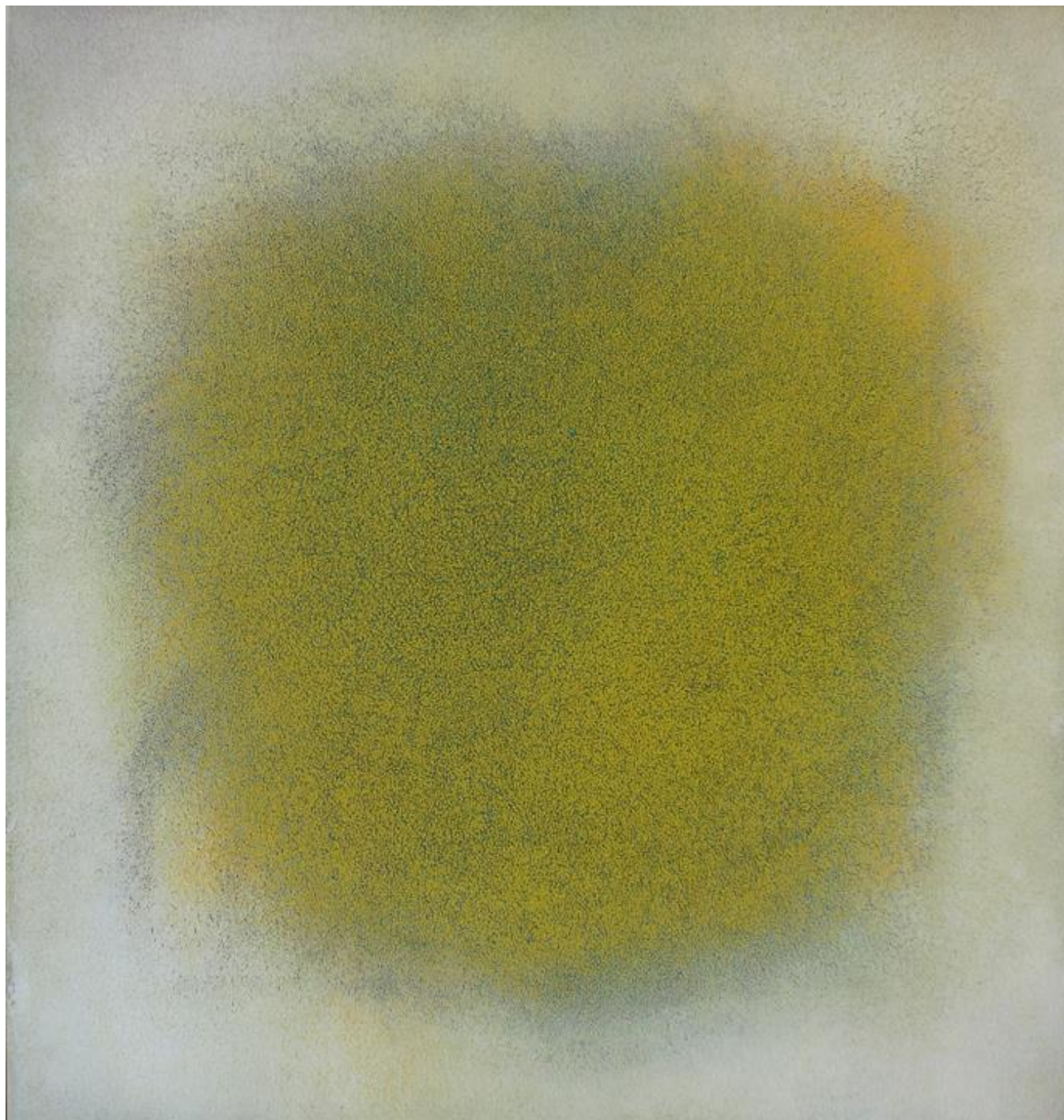
Natvar Bhavsar , Saranga , 2009, Oil on canvas, 42 x 40 in.