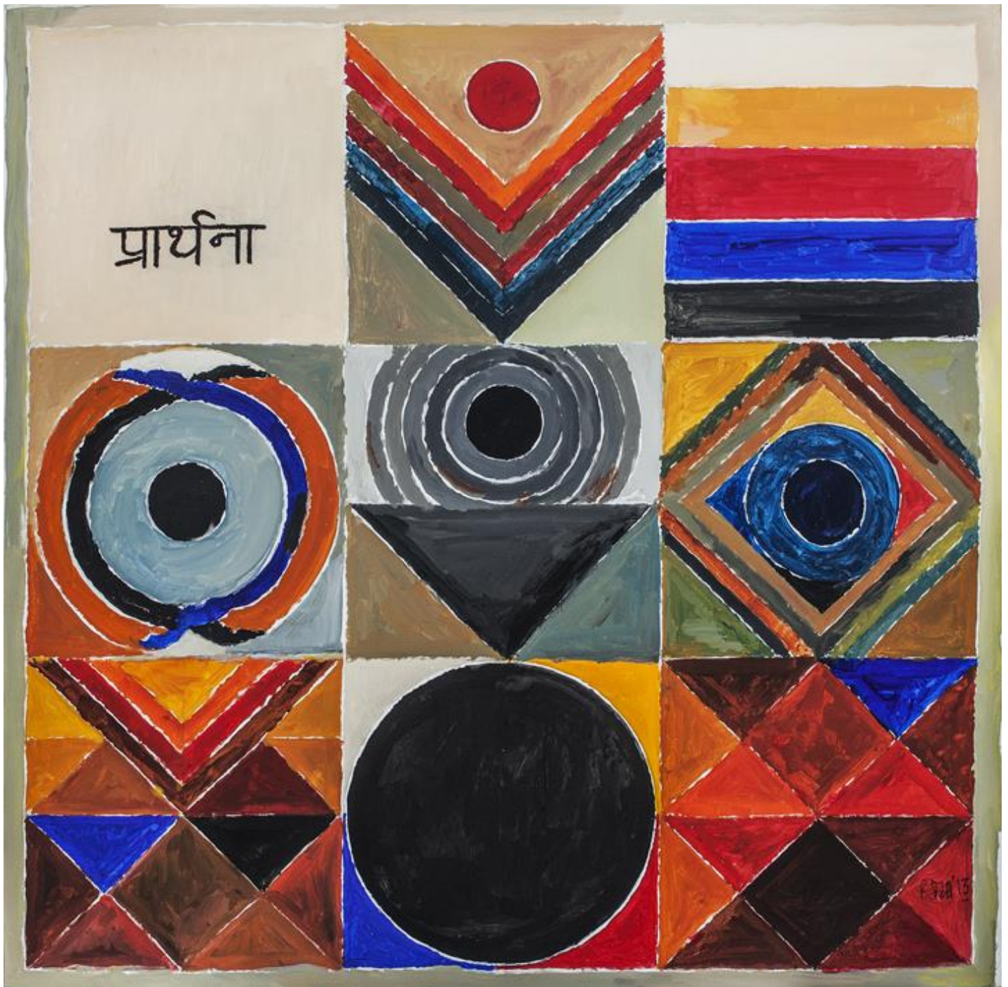
S. H. Raza, Prarthana , 2013, Acrylic on canvas 40 x 40 in.