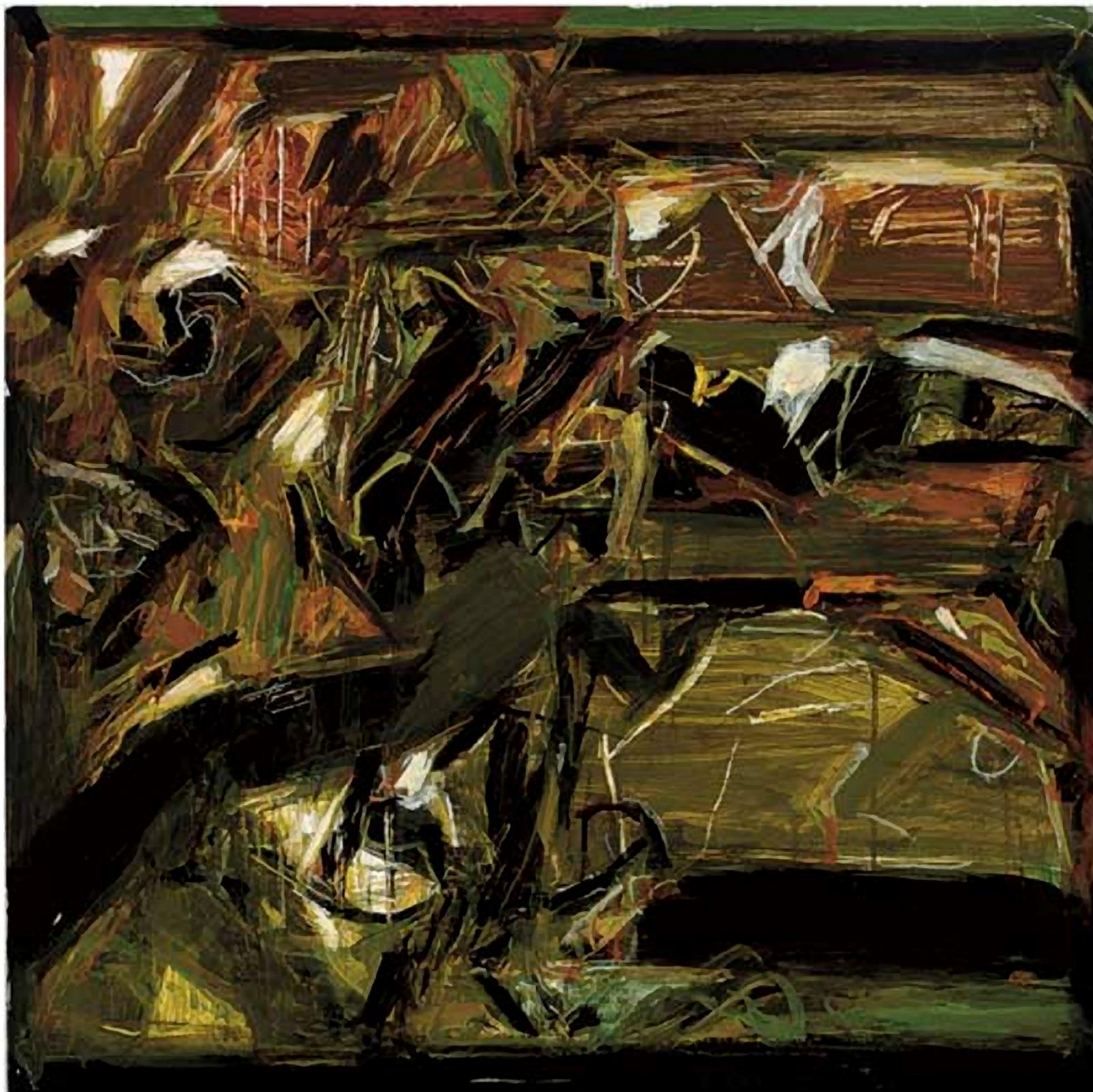
S. H. Raza, Untitled Abstract , 1970s, Acrylic on card, 31.5 x 31.5 in.