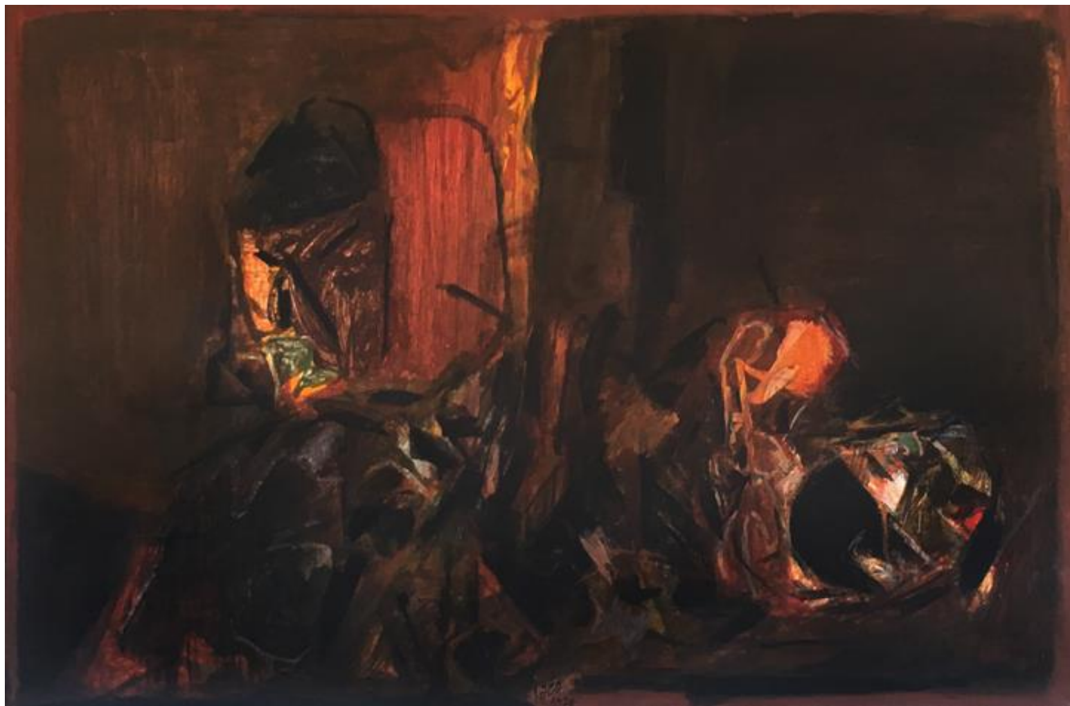
S. H. Raza , Untitled (La Terre) , 1978, Oil on canvas, 21.5 x 31.5 in.