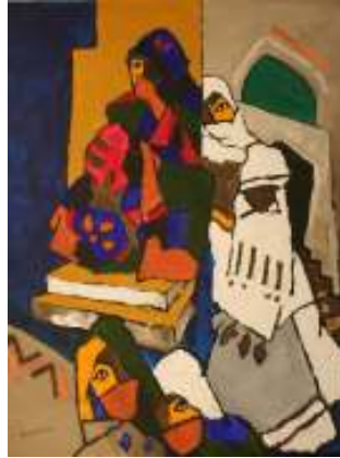
M.F. HUSAIN WOMEN FROM YEMEN 2006 WATERCOLOR ON PAPER 58 X 46 INCHES