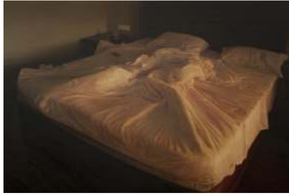
Abir Karmakar, Scent II , 2011, Oil on canvas, 48 x 72 in.