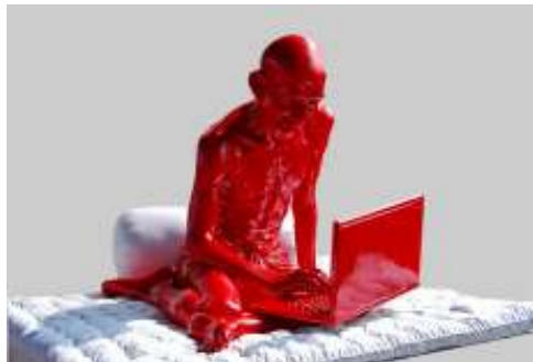
DEBANJAN ROY INDIA SHINING I (GANDHI AND THE LAPTOP) EDITION OF 5 2007 Fiberglass with acrylic paint 27 x 46 x 30 in.