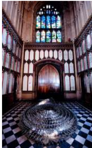
Asian Art Triennial, Manchester