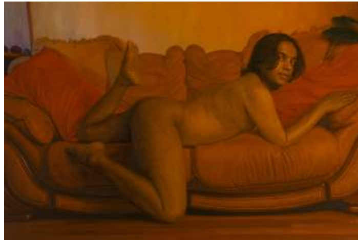
Abir Karmakar, In The Old Fashioned Way 5 , 2007, oil on canvas, 72 x 107 in.