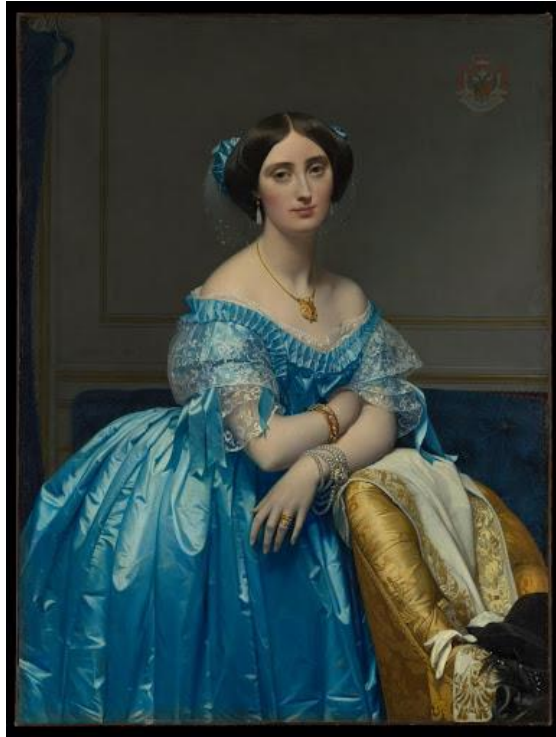
Jean-Auguste-Dominique Ingres, The Princesse de Broglie (1851–1853). Collection of the Metropolitan Museum of Art.

The clarity and simplicity of Hans Holbein's draughtsmanship, as seen in his portrait of an unknown woman, is a recent discovery for me, and deeply instructive as I aim to use pictorial means with absolute purpose and power.