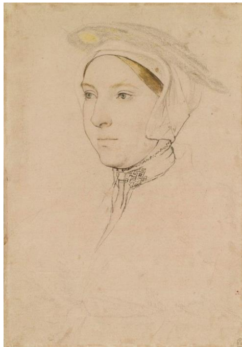
Hans Holbein, Portrait of an Unknown Lady (16th century).

While the meaning of the pinching fingers gesture (representing pregnancy) may have been understood by likely viewers of the painting at the time, it is now, startlingly intimate and strange.