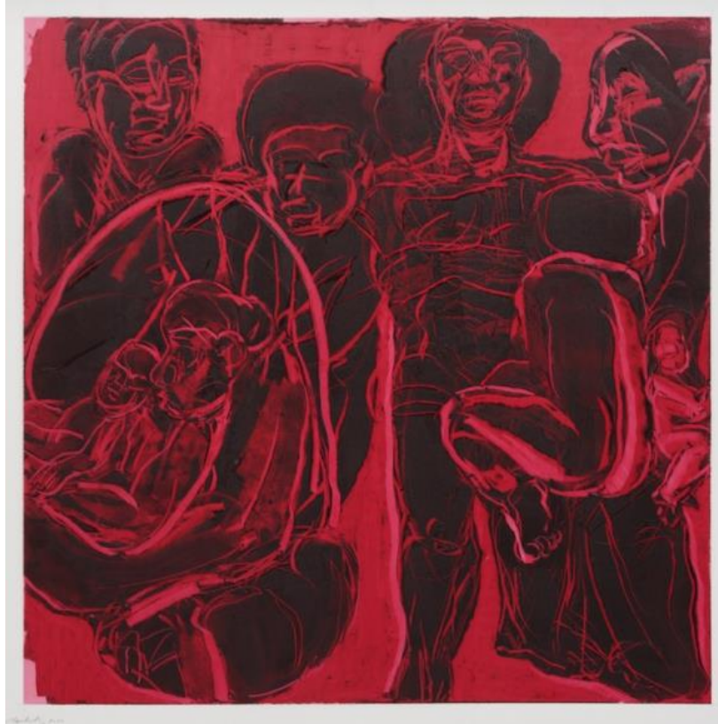
Mequitta Ahuja, Emerge (2020).