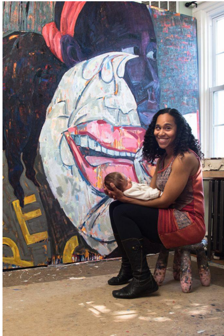
The artist Mequitta Ahuja, 2019.