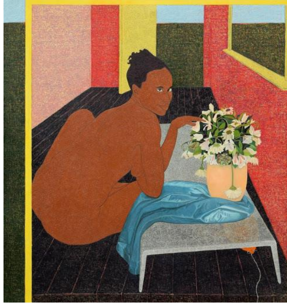
Mequitta Ahuja, Fingering Vanitas (2015).