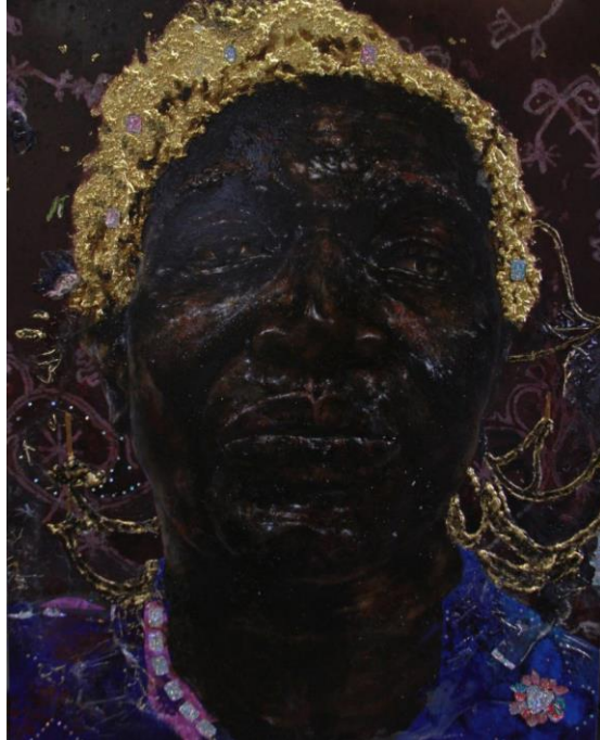
Sherwin Ovid, The Cult of My Black Mother . Courtesy of the artist and Mequitta Ahuja.

If you could own any artwork in the world (no restrictions) what would it be?