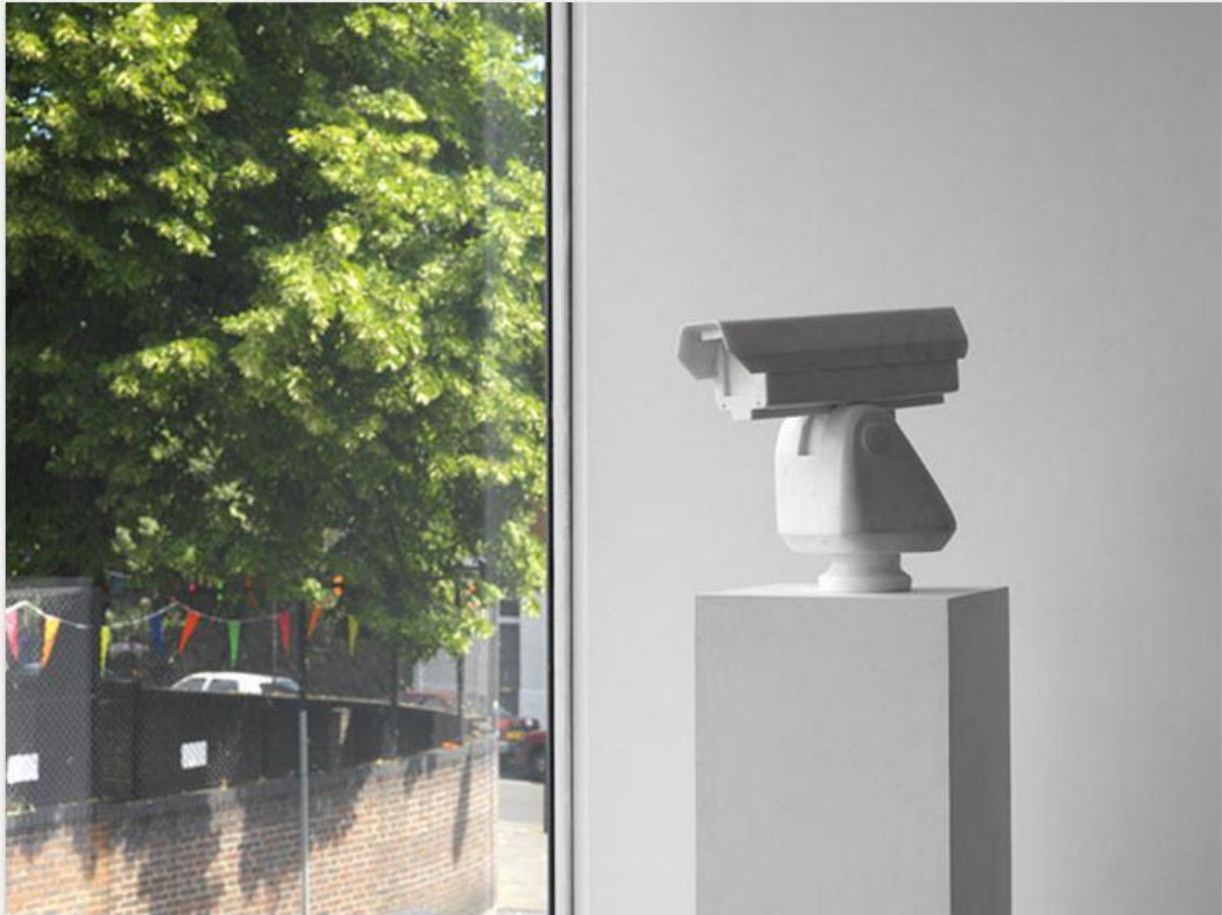
Ai Weiwei, 'Surveillance Camera', 2010. Marble, 39.2 x 39.8 x 19 cm. Image courtesy Lisson Gallery and the artist.