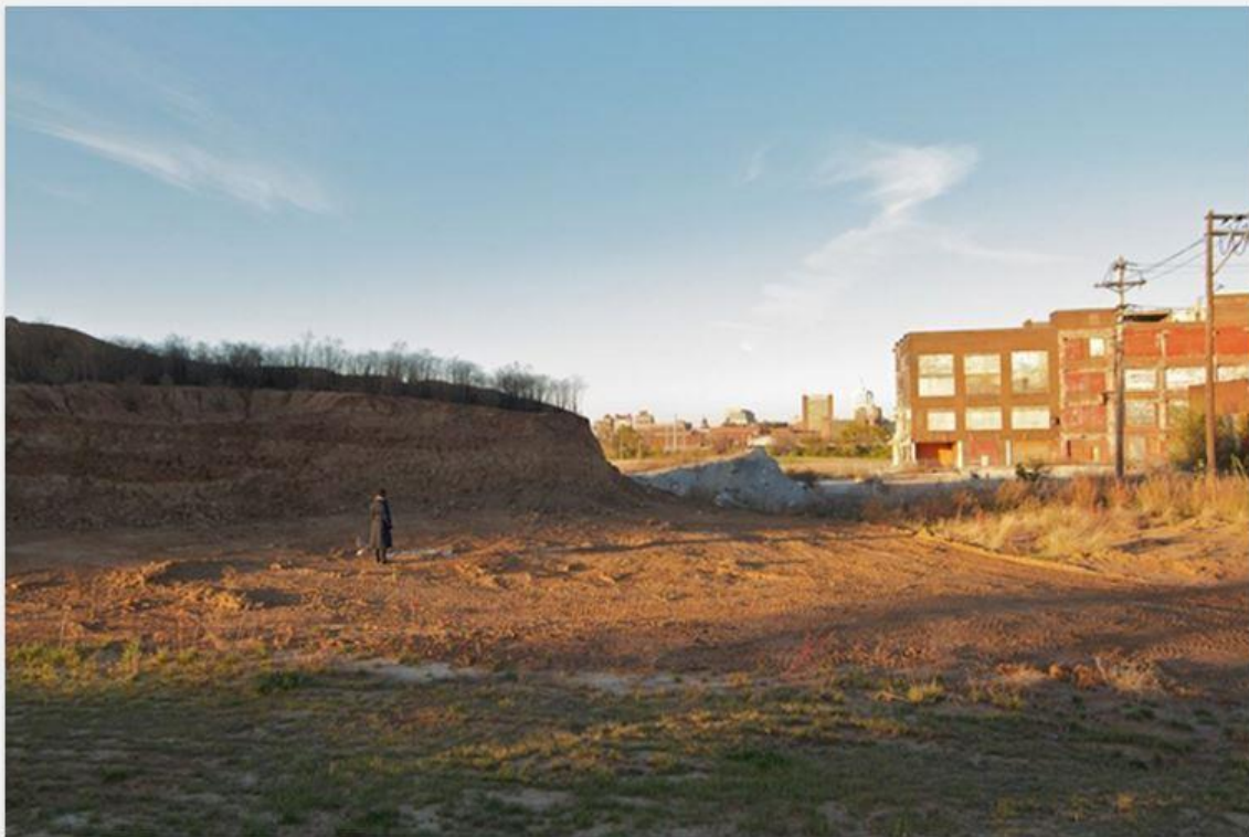
Mariam Ghani, 'The City & The City: Mill Creek Valley', 2015. Inkjet print mounted on aluminum, 30 x 45 inches, Edition of 5.