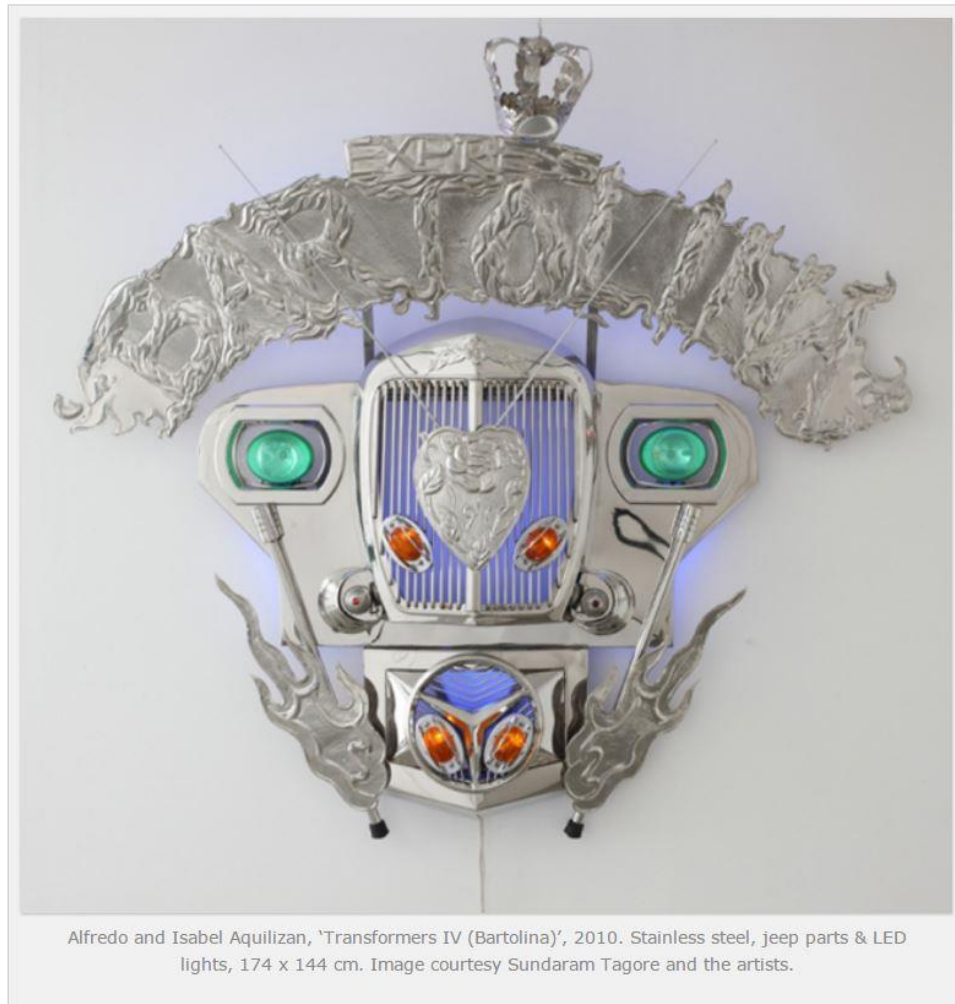
Alfredo and Isabel Aquilizan, 'Transformers IV (Bartolina)', 2010. Stainless steel, jeep parts & LED lights, 174 x 144 cm. Image courtesy Sundaram Tagore and the artists.