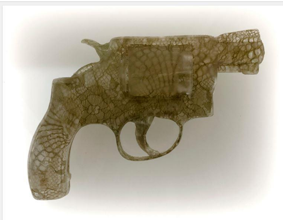
Nikki Luna, 'Quince', 2016. Cast resin and lace, sculpture in lightbox. 24.4 x 30 x 7.6 cm.