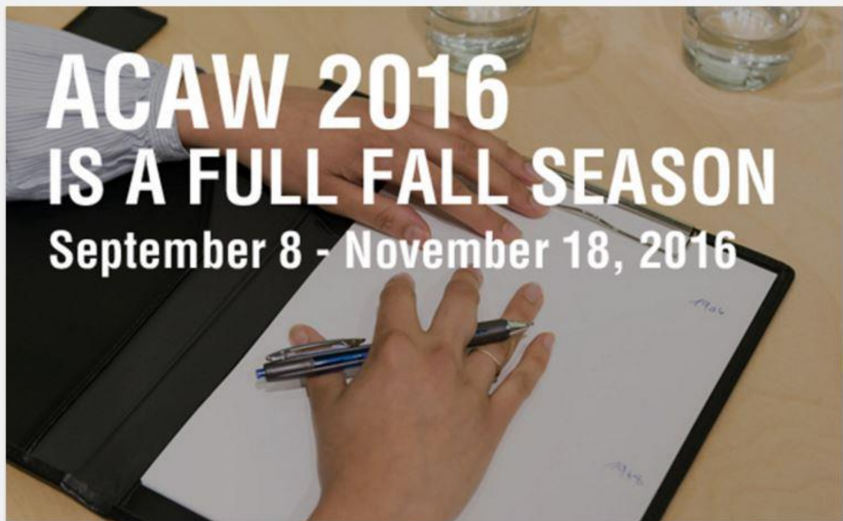
Asian Contemporary Art Week Poster, 2016.

Asia Contemporary Art Week is a series of exhibitions, events and symposia held across New York City that seeks to heighten the awareness and visibility of contemporary art practices from Asia within the United States and Asia. A range of institutions is participating in New York between 8 September and 18 November 2016.