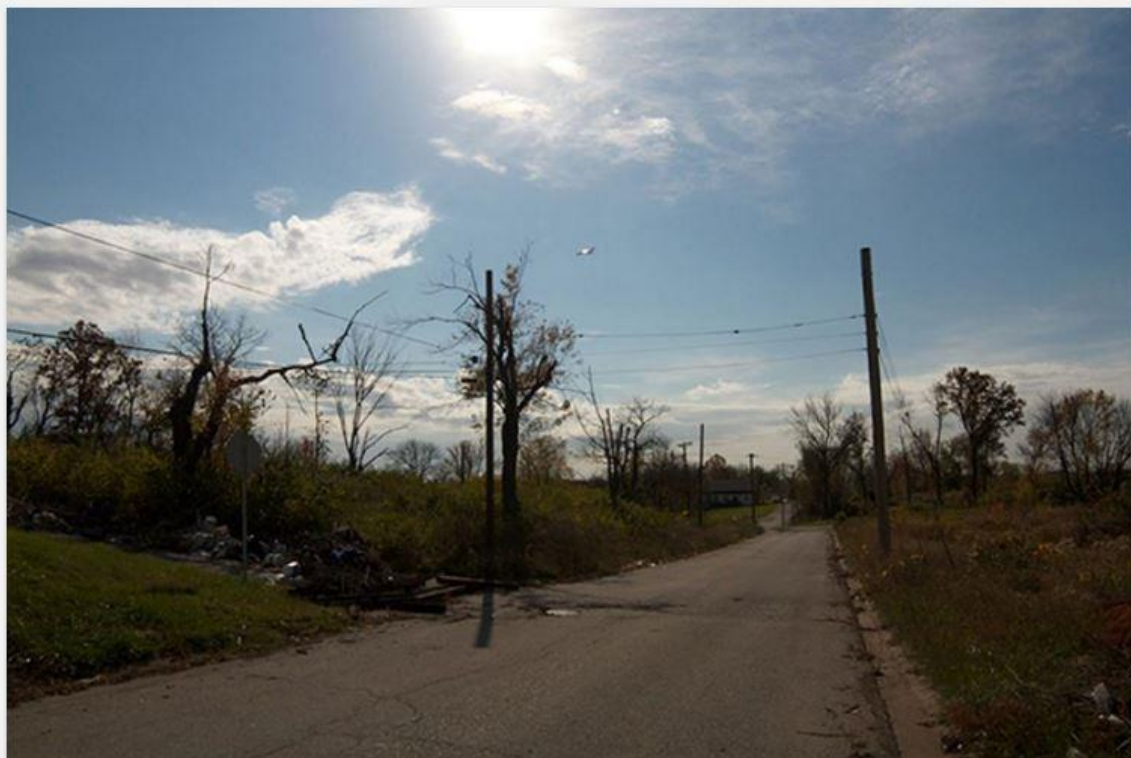
Mariam Ghani, 'The City & The City: Kinloch Flight Path', 2015. Inkjet print mounted on aluminum, 30 x 45 inches, Edition of 5.